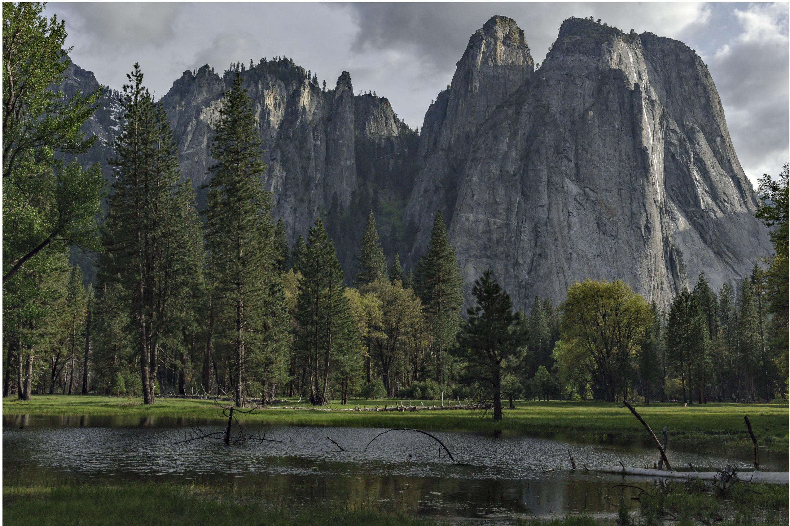
2011 Processing (Probably with NIK plug in)