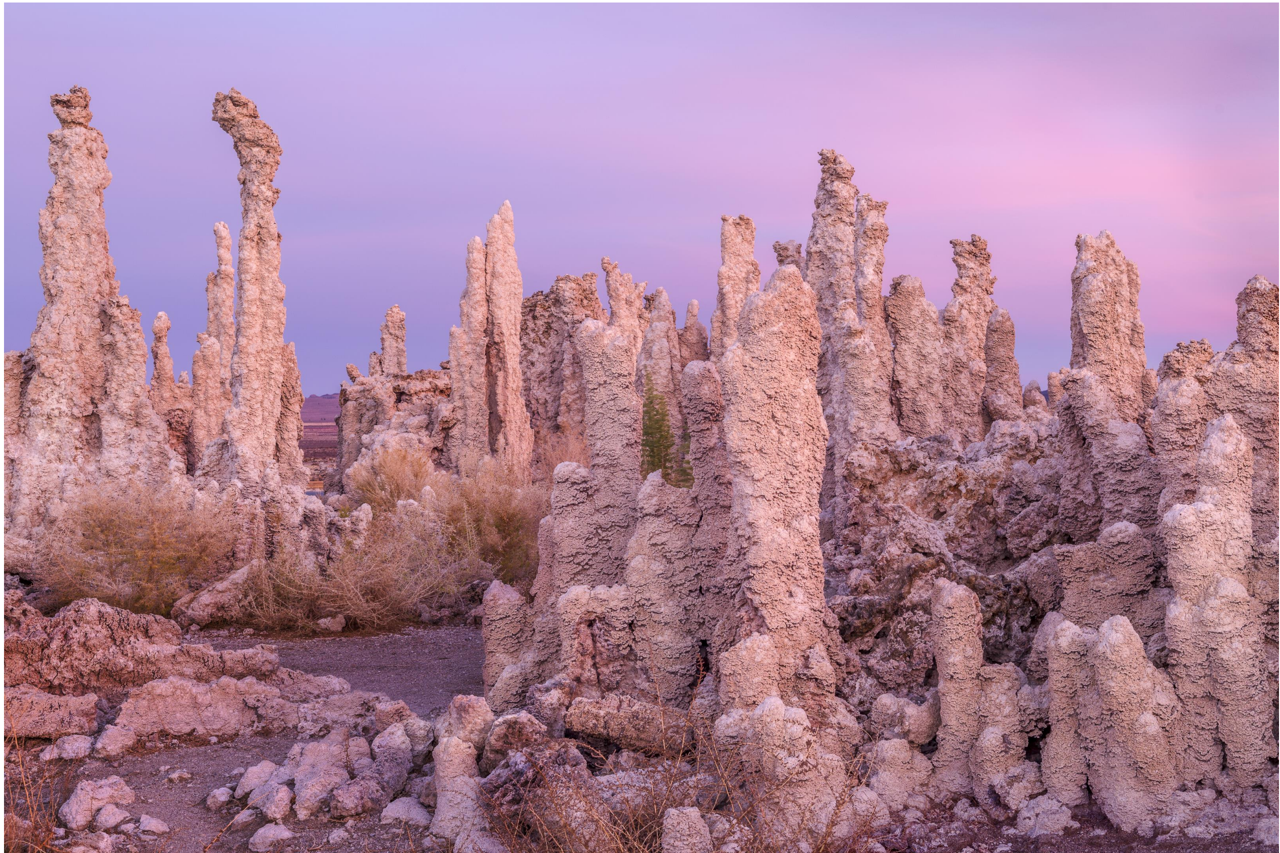
Mono Lake, California