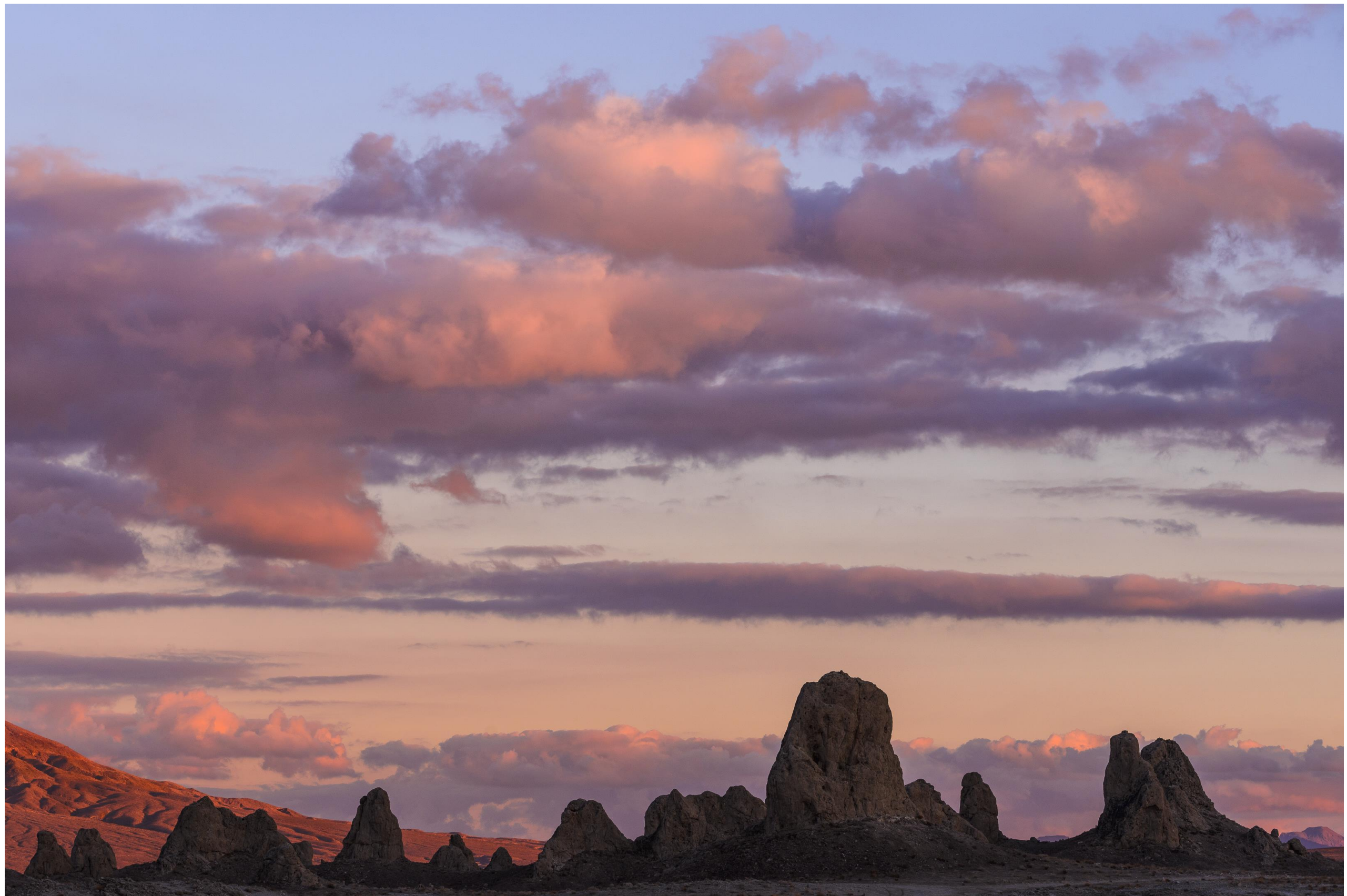
Trona Pinnacles, California