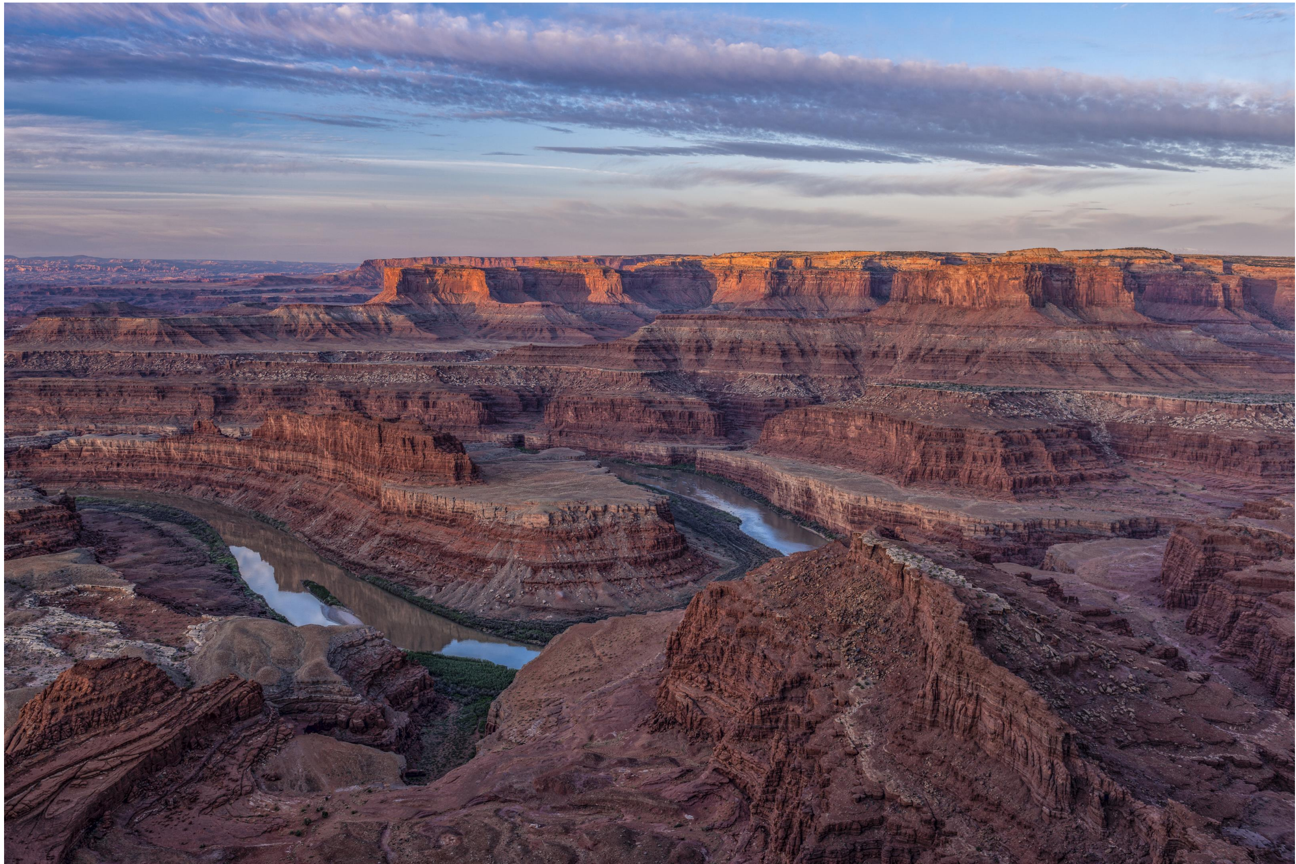
Dead Horse Point, Canyon Lands, Utah