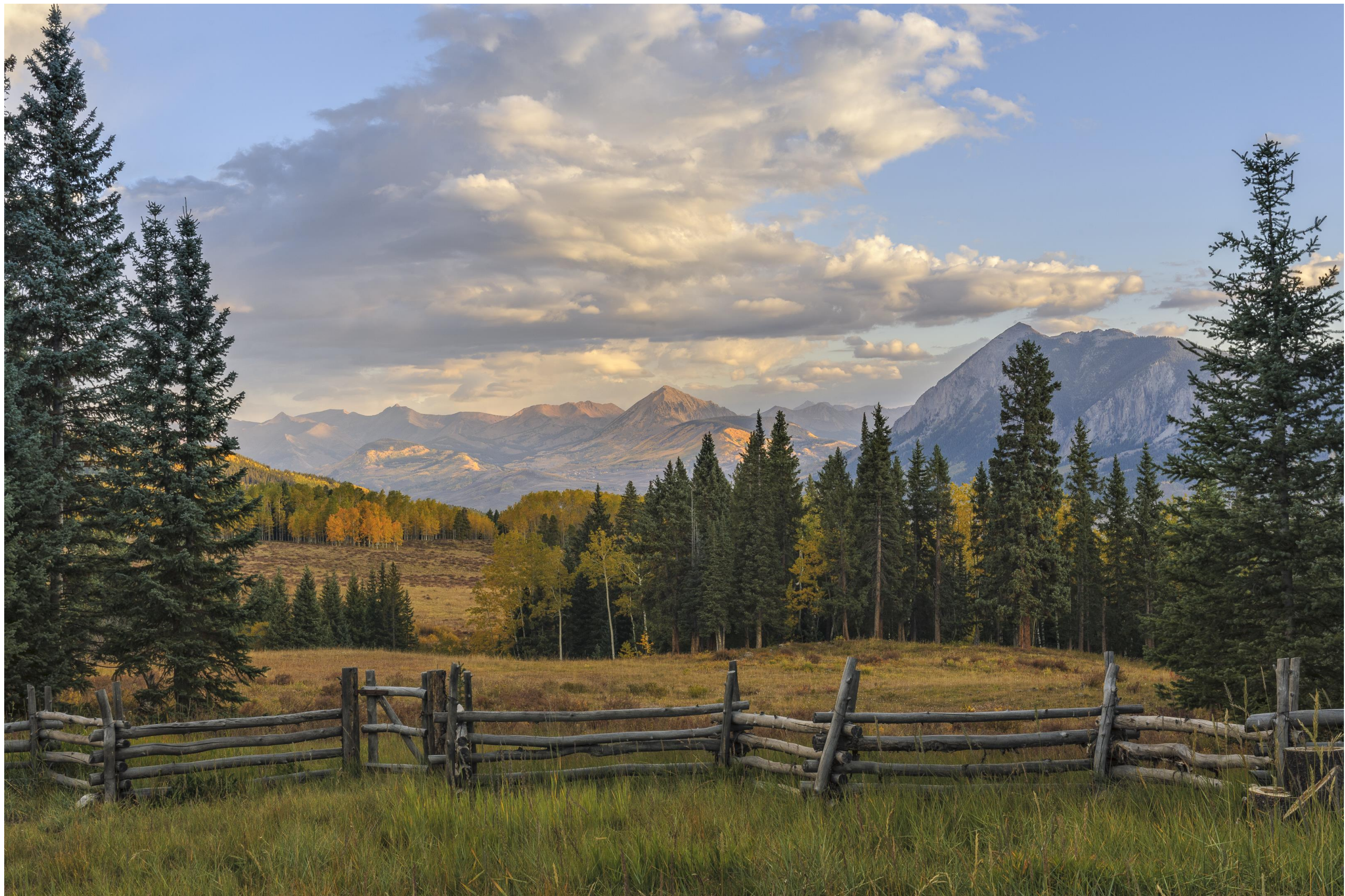
2016 Processing (with Lightroom)