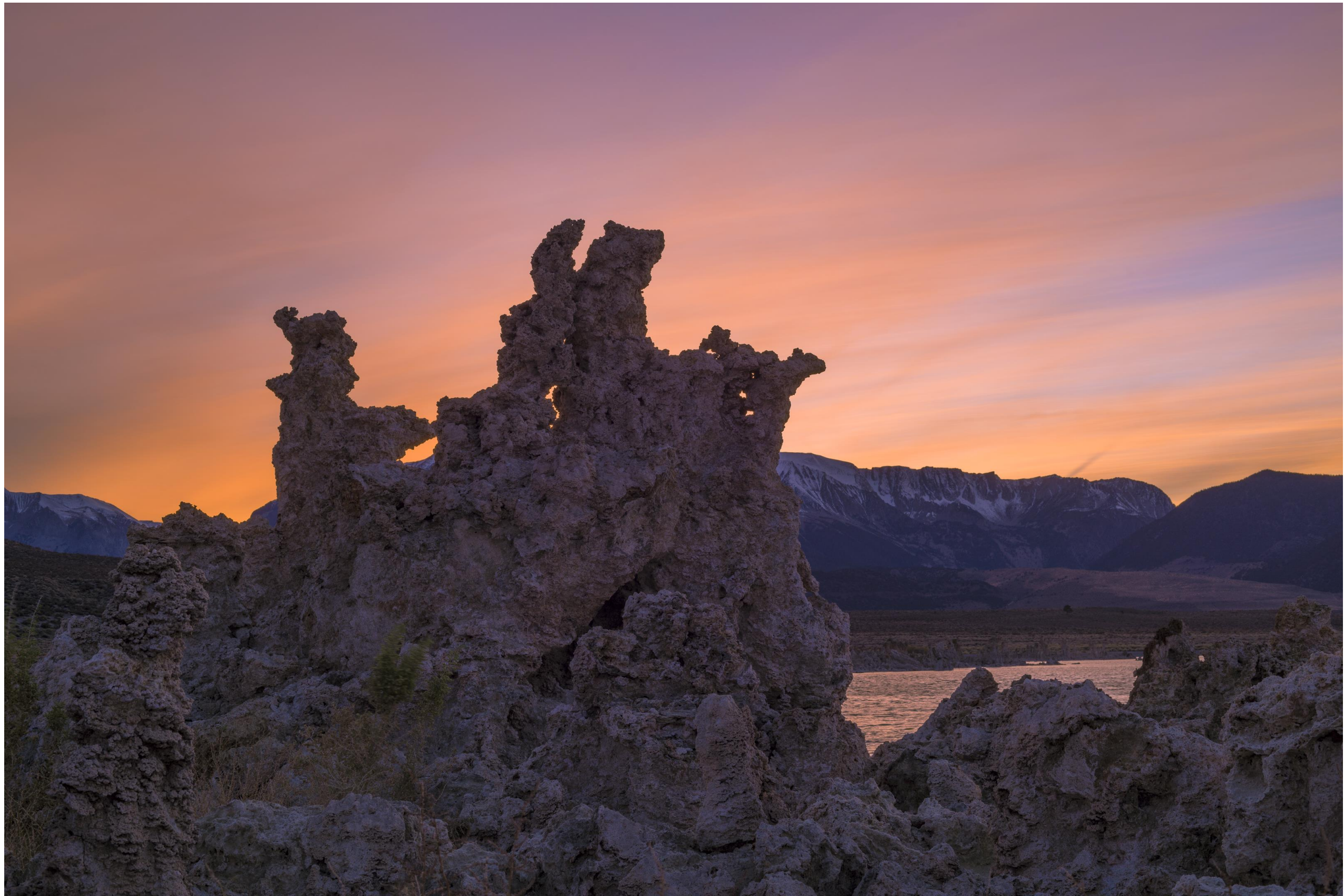
Mono Lake, California