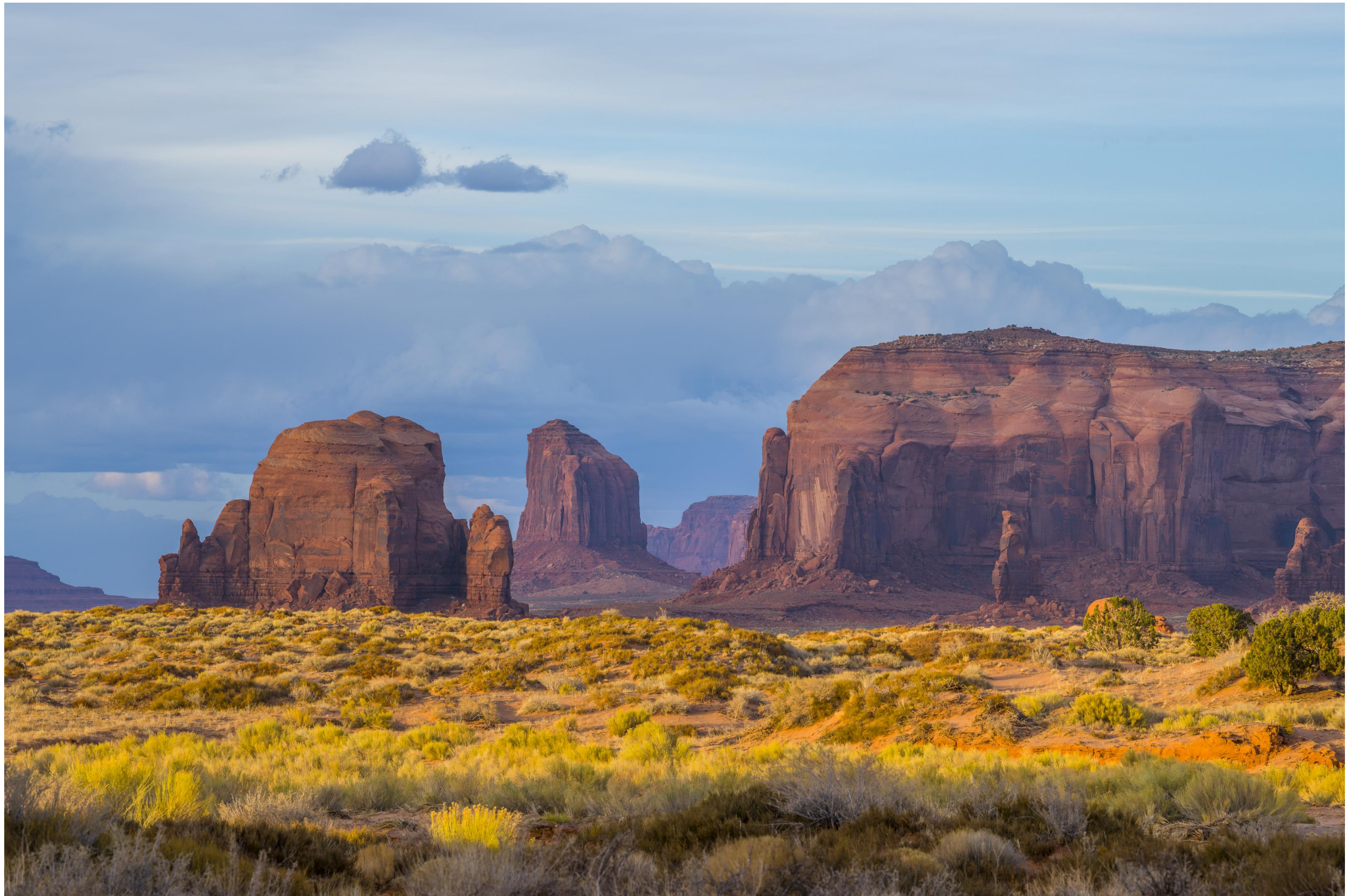
200mm Monument Valley, Utah/Arizona