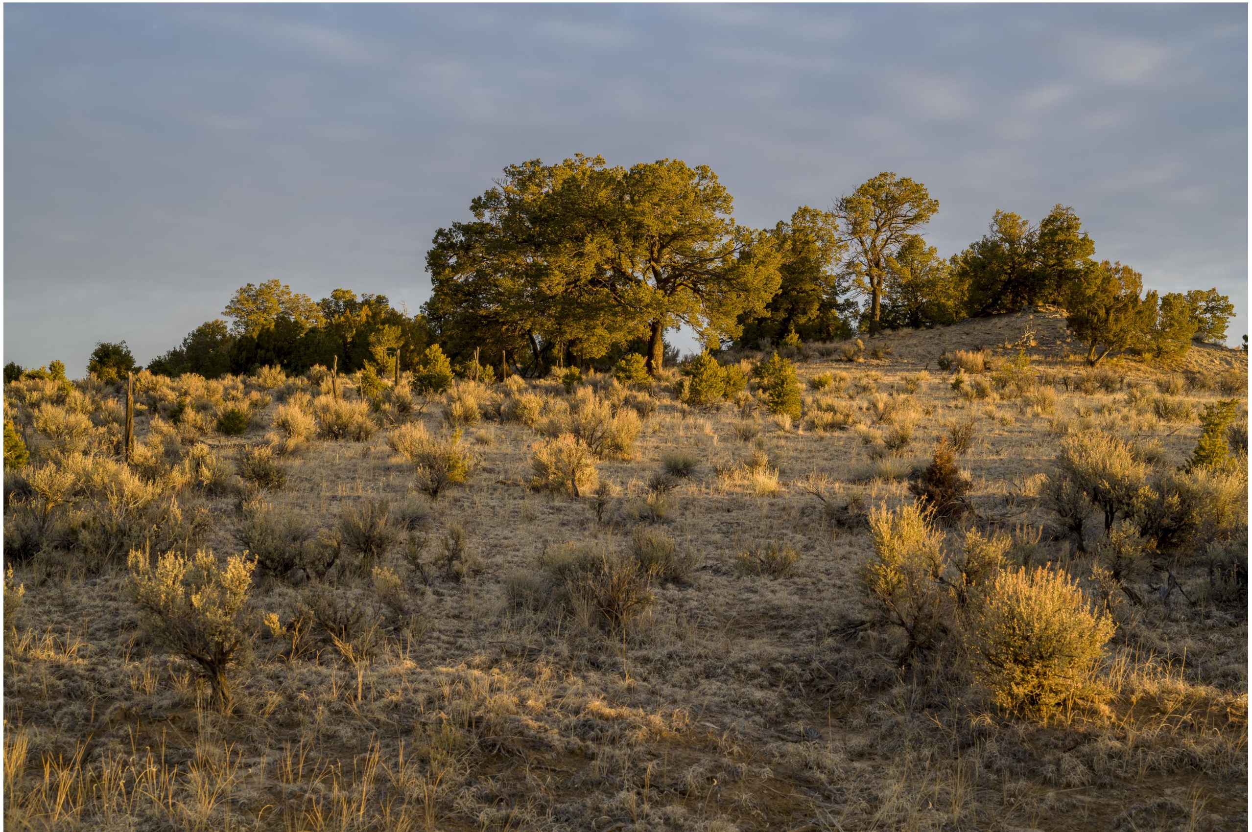
8:39:10 Near Cuba New Mexico