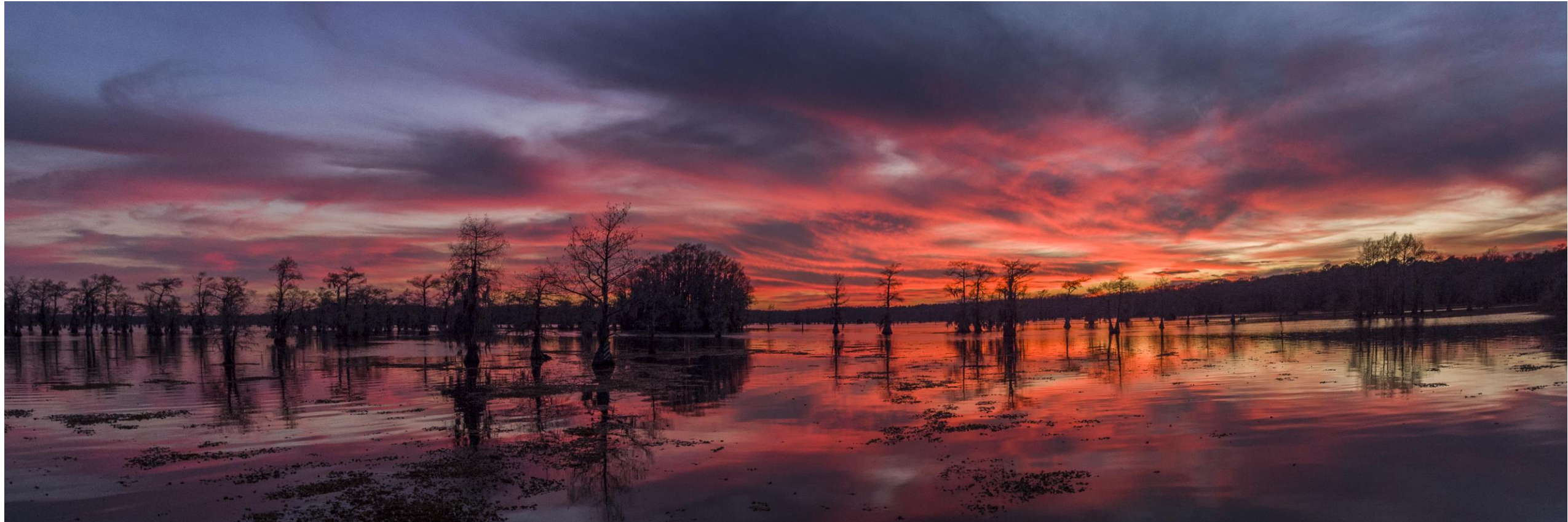
Caddo Lake, Texas