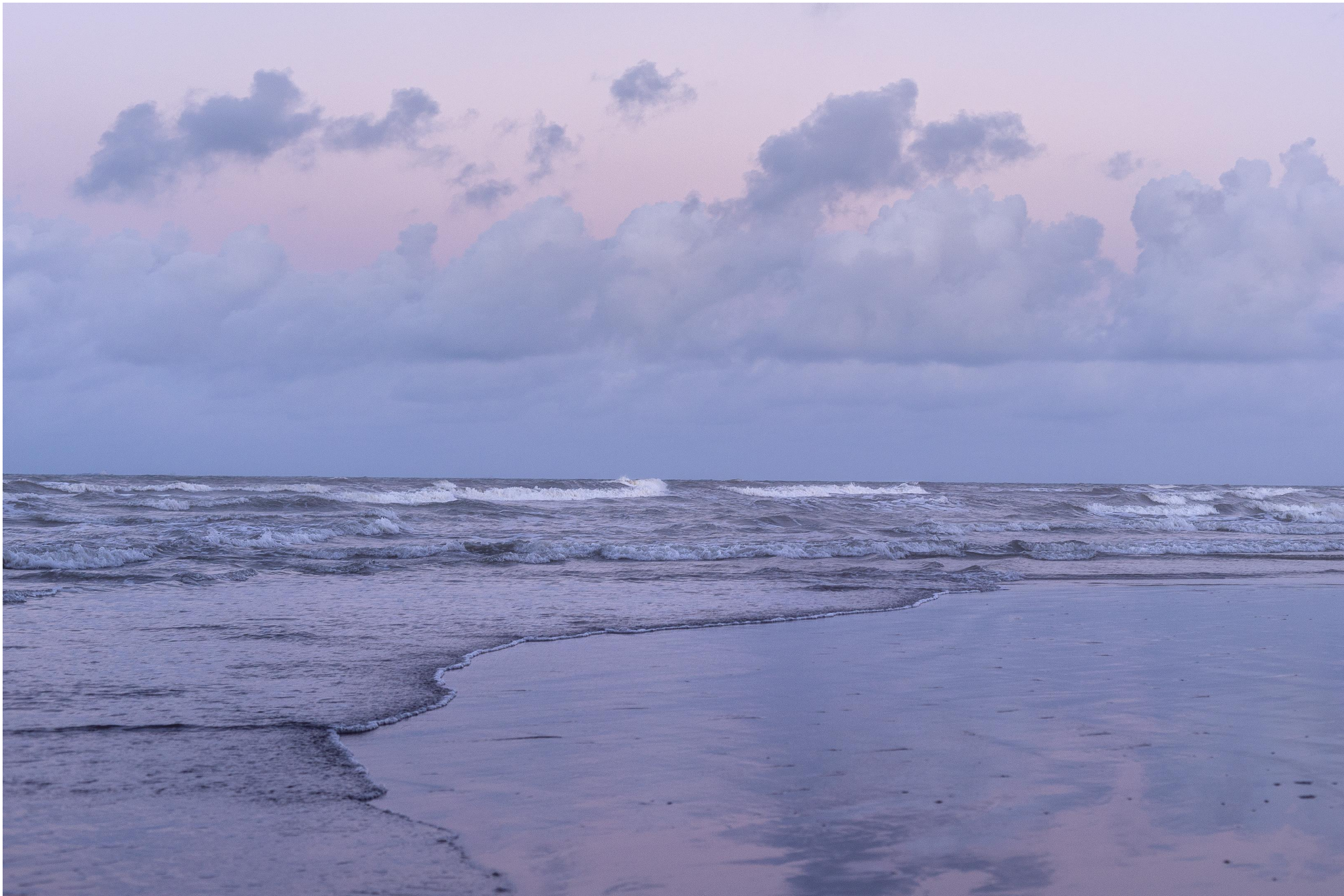
Galveston Island, Texas