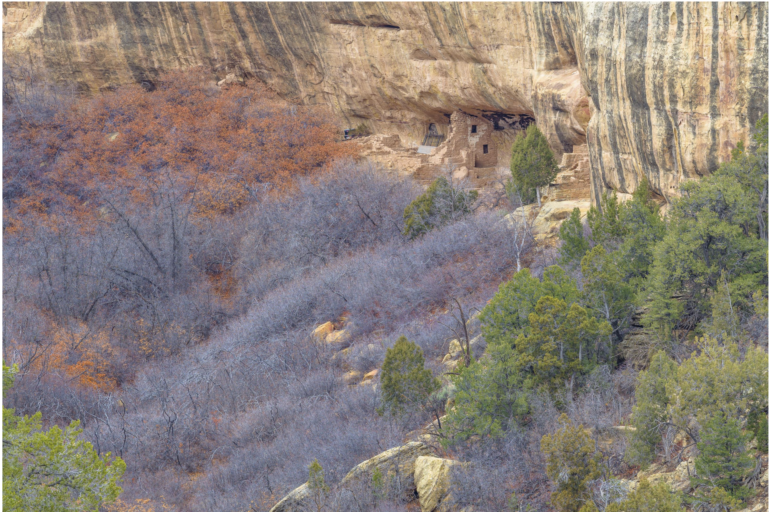
300mm Mesa Verde, Colorado