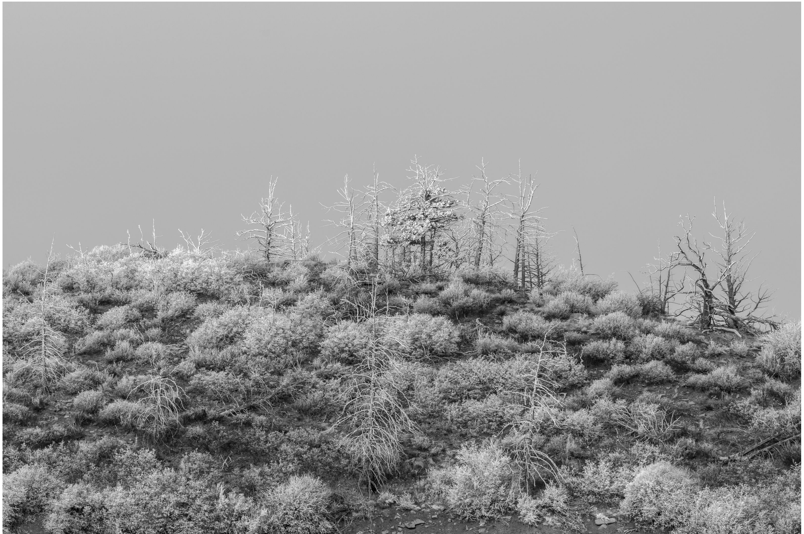
200mm Mesa Verde, Colorado