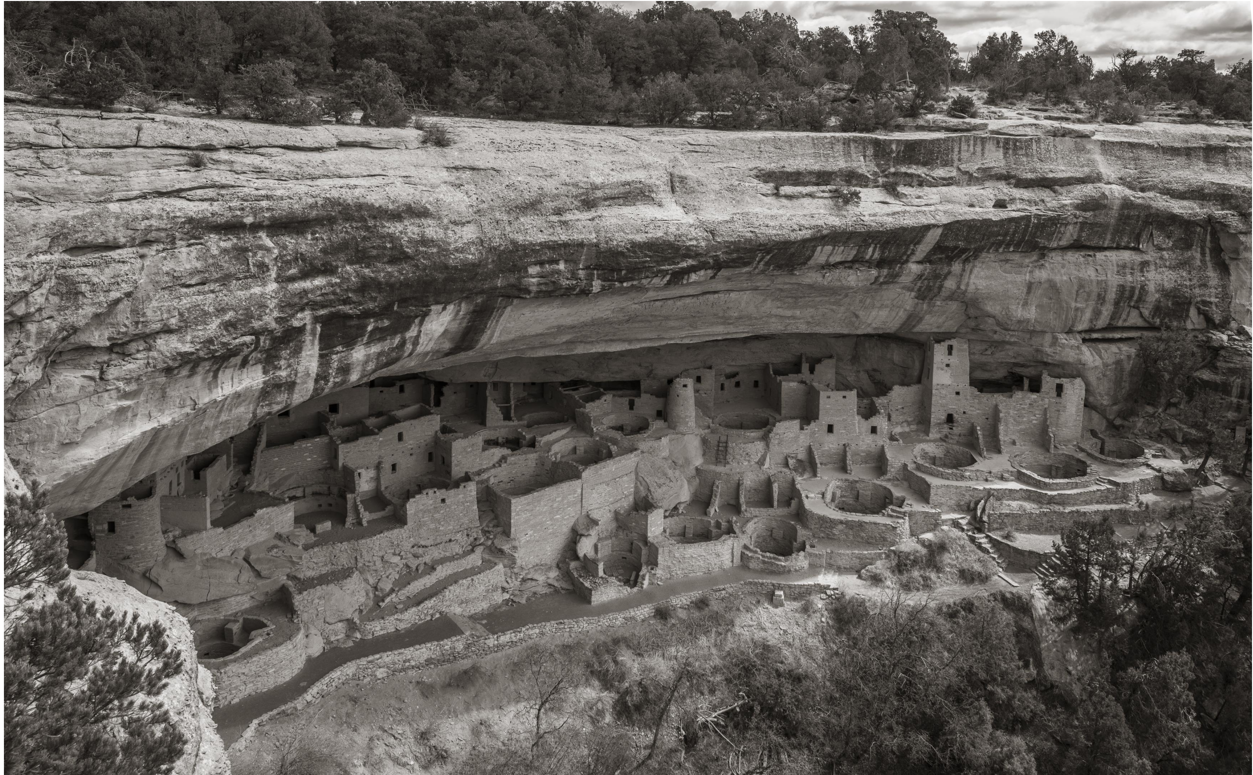
24mm Mesa Verde National Monument, Colorado