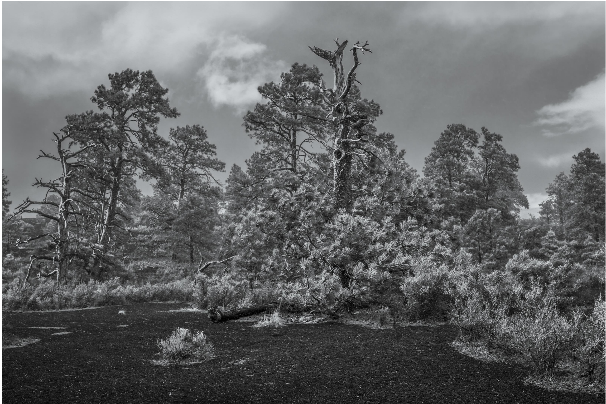
50mm Sunset Crater, Arizona