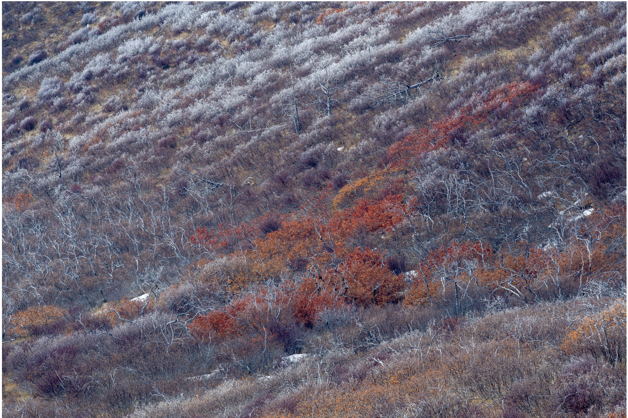
450mm Mesa Verde, Colorado