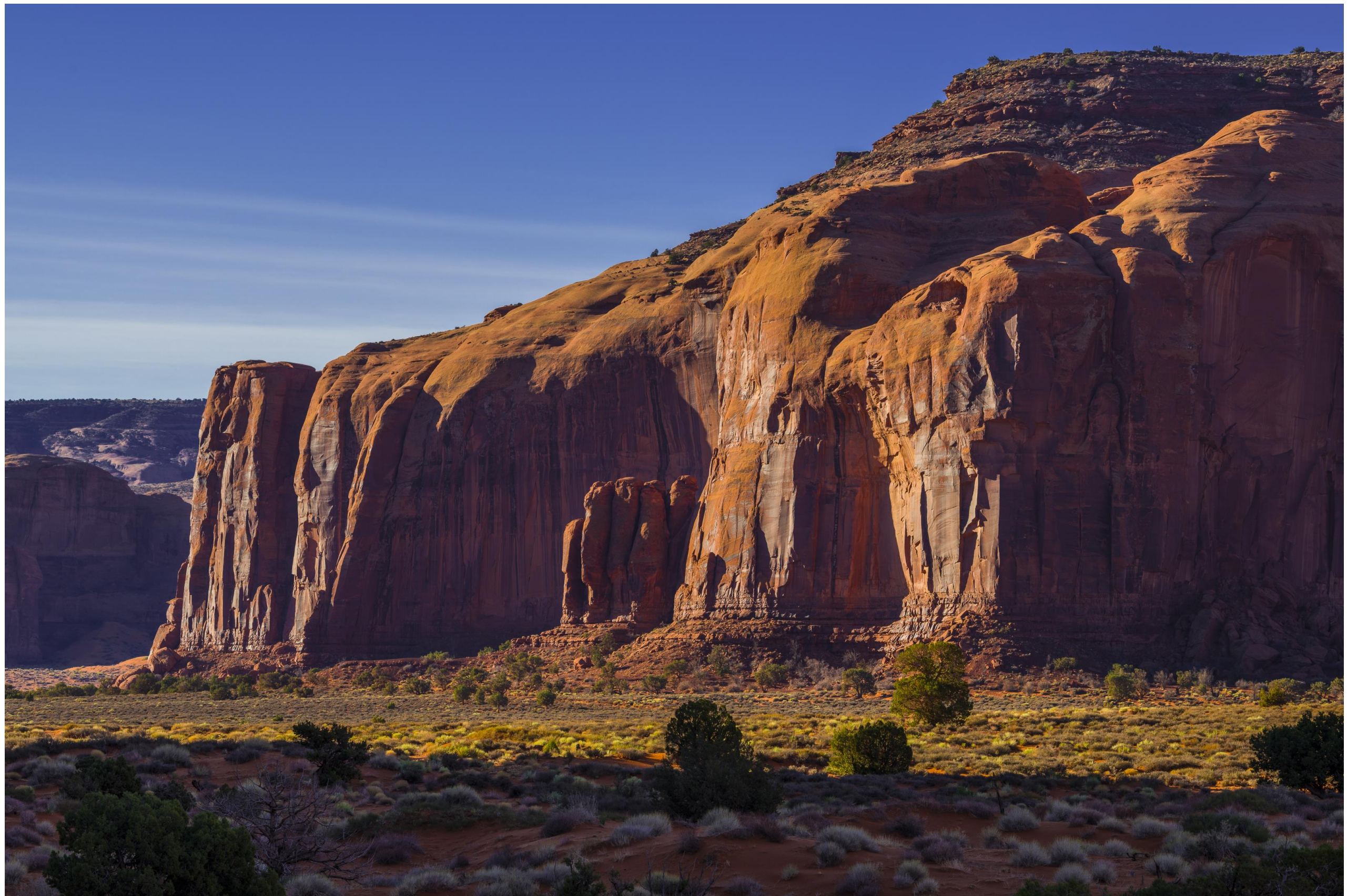
Monument Valley, Utah/Arizona