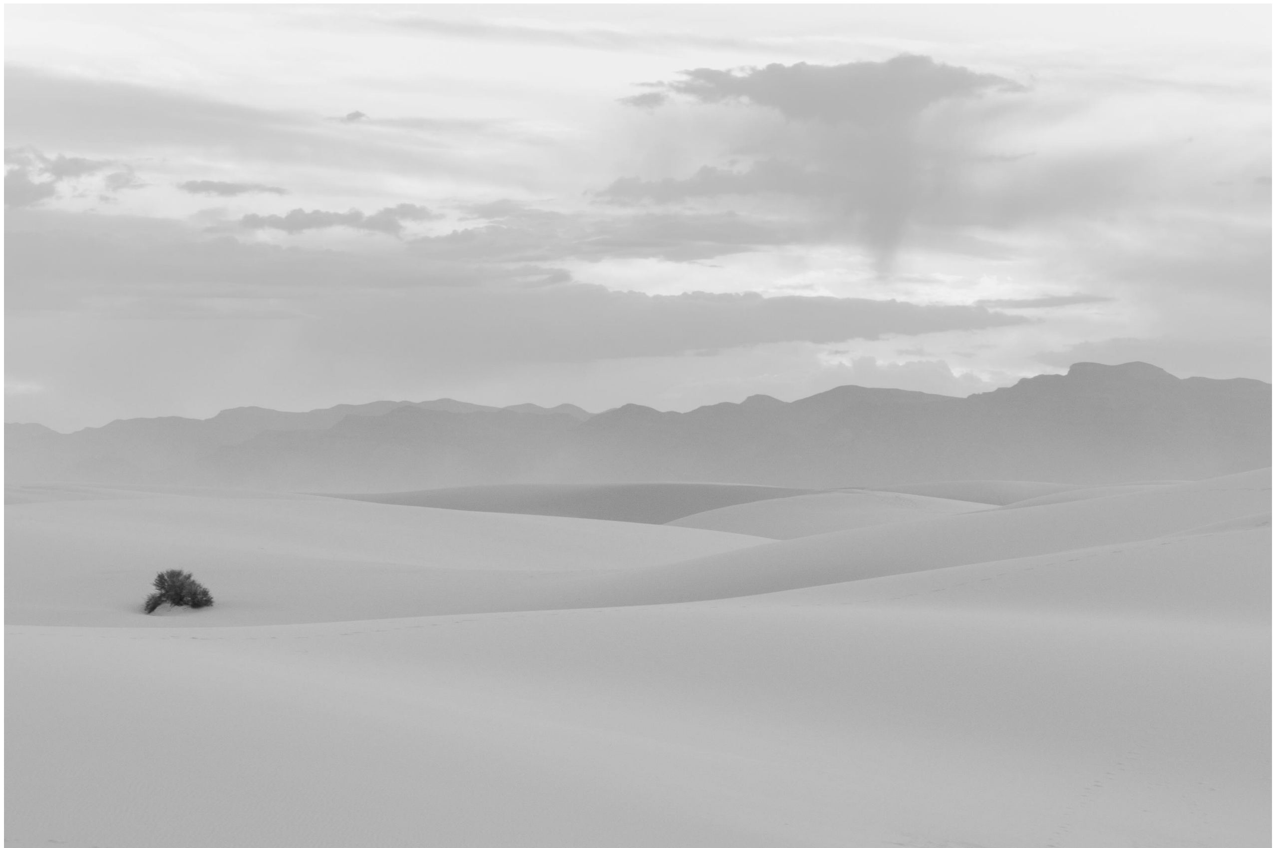
White Sands National Monument, New Mexico