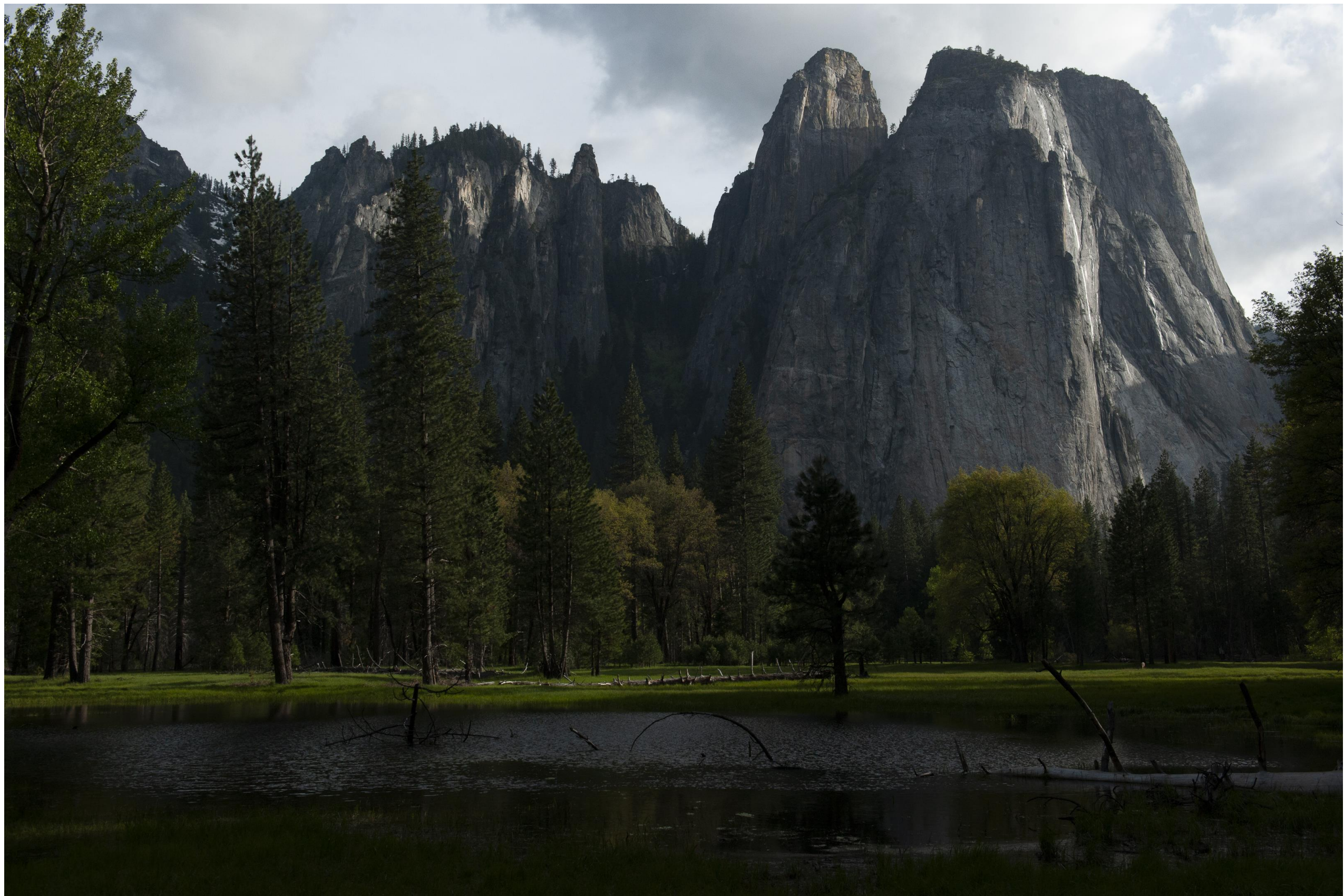
Raw Capture (Nikon D3X)