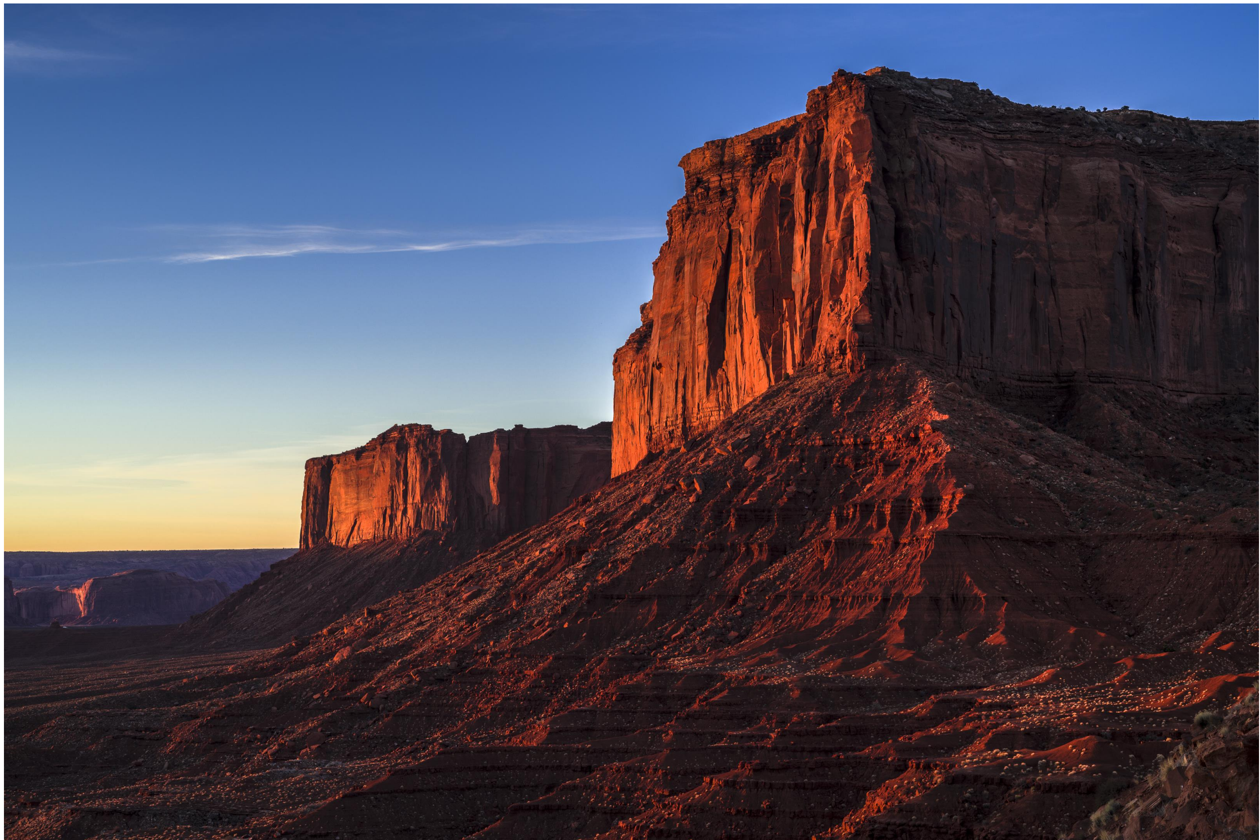
50mm Monument Valley, Utah/Arizona