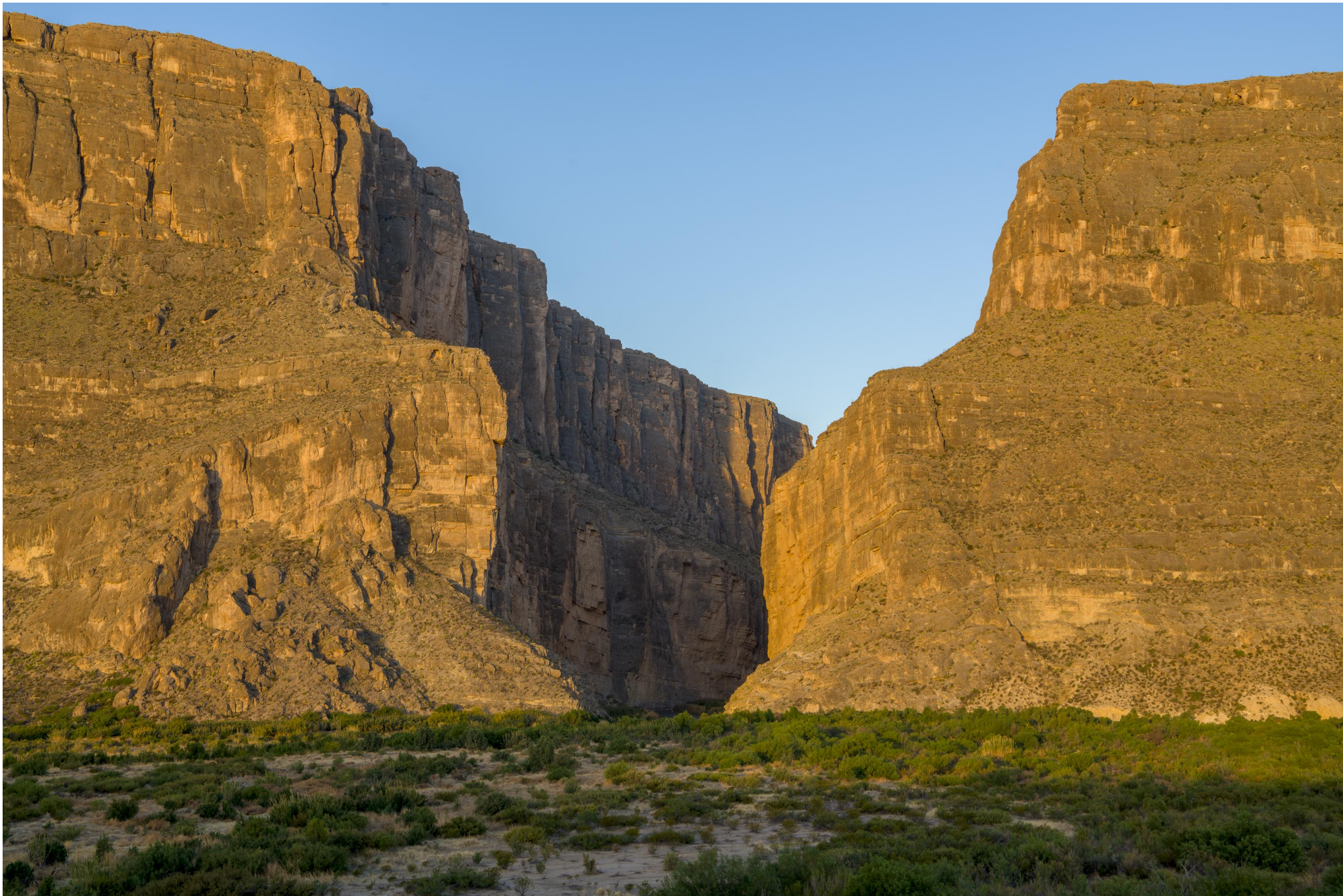
Santa Elena Canyon, Big Bend National Park, Texas