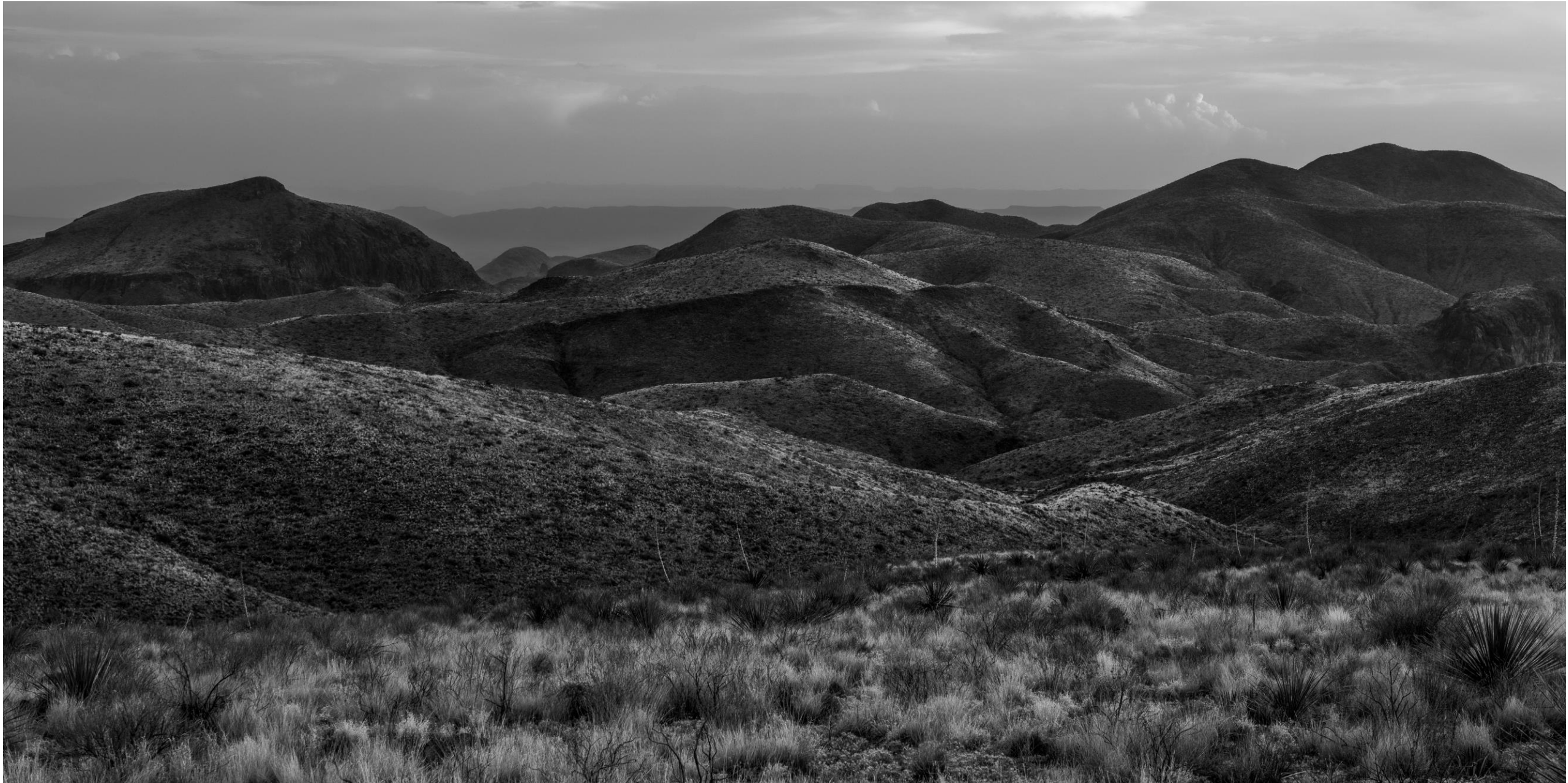
Big Bend National Park, Texas