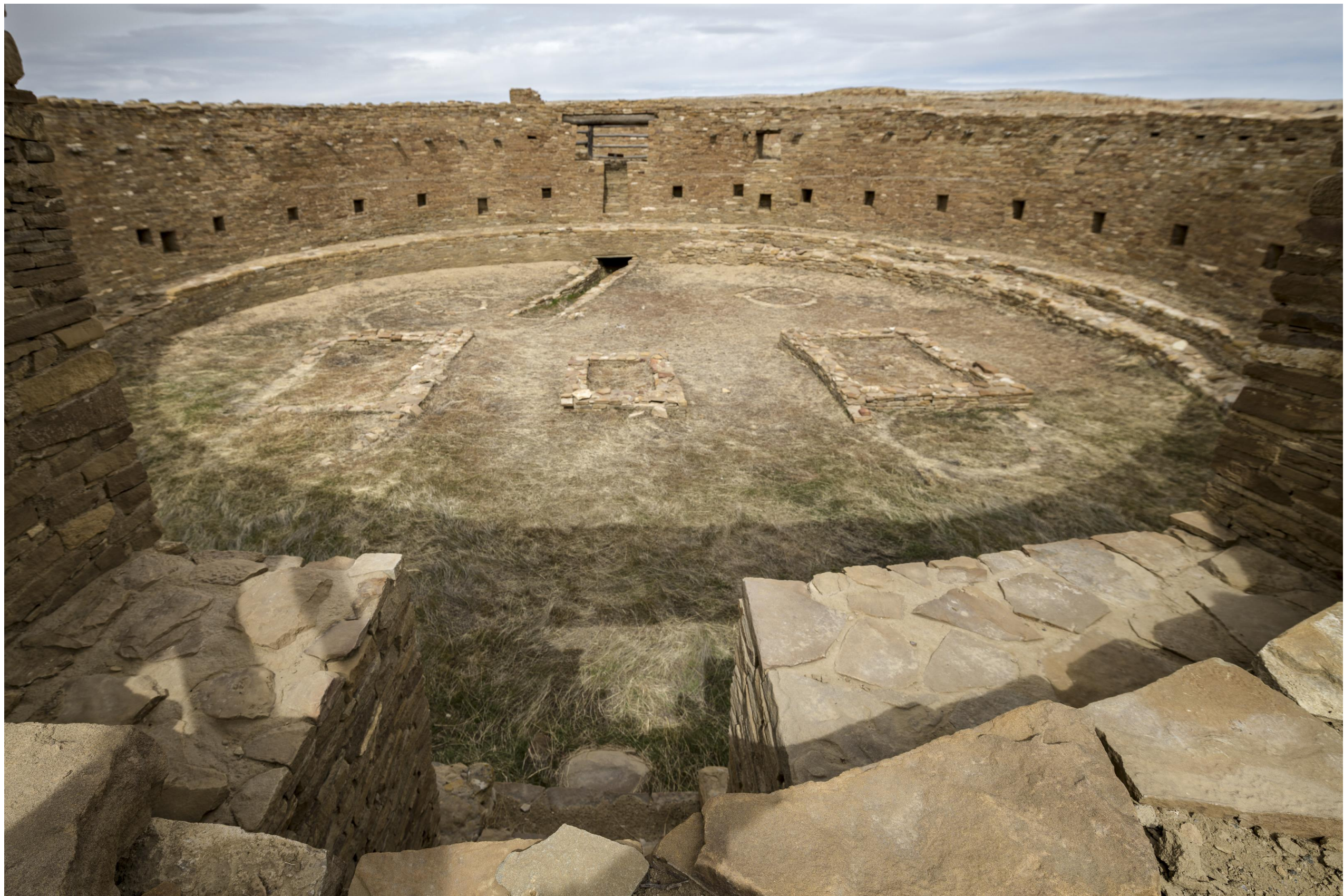
14mm Chaco Canyon, New Mexico