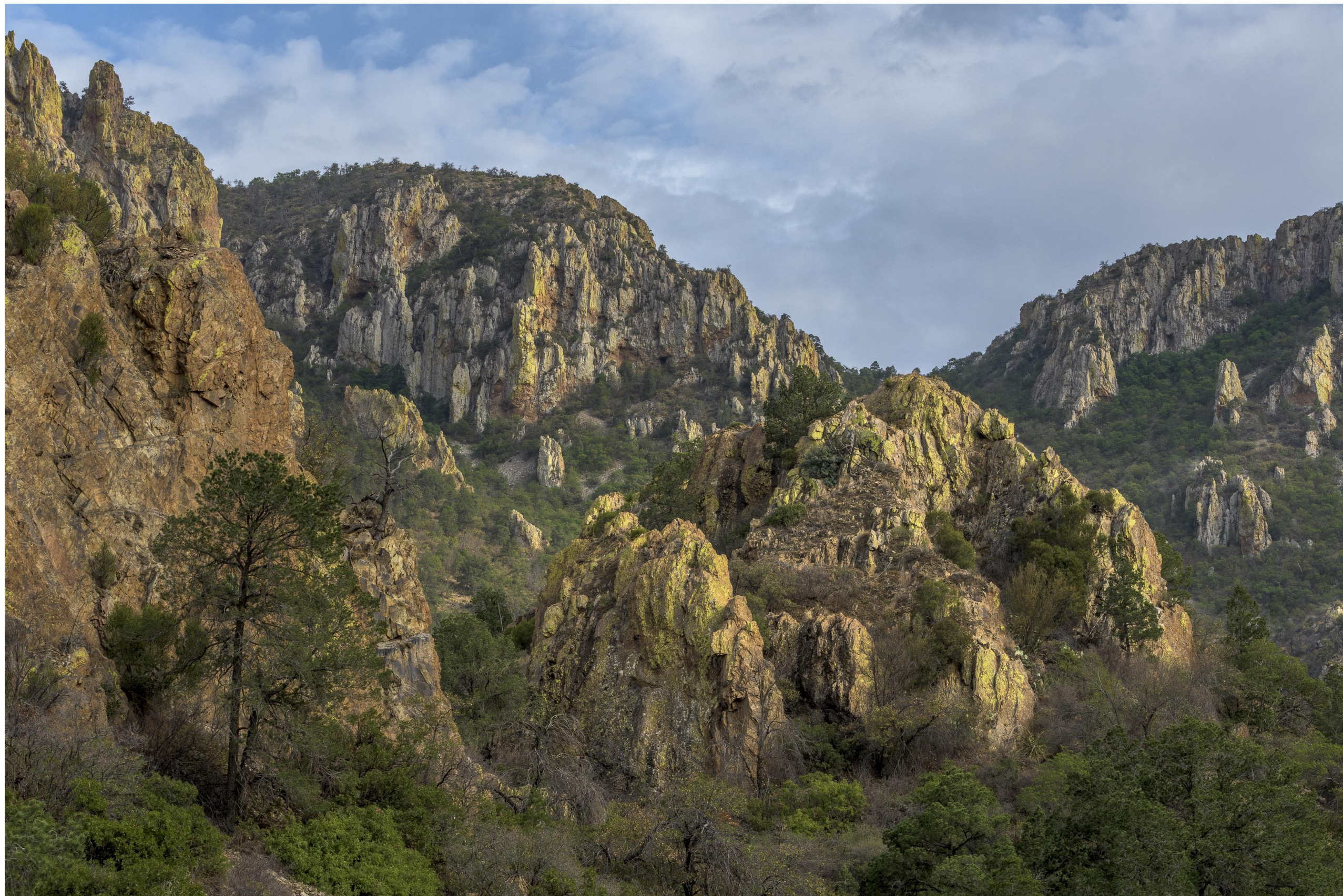
Chisos Mountains, Big Bend National Park, Texas