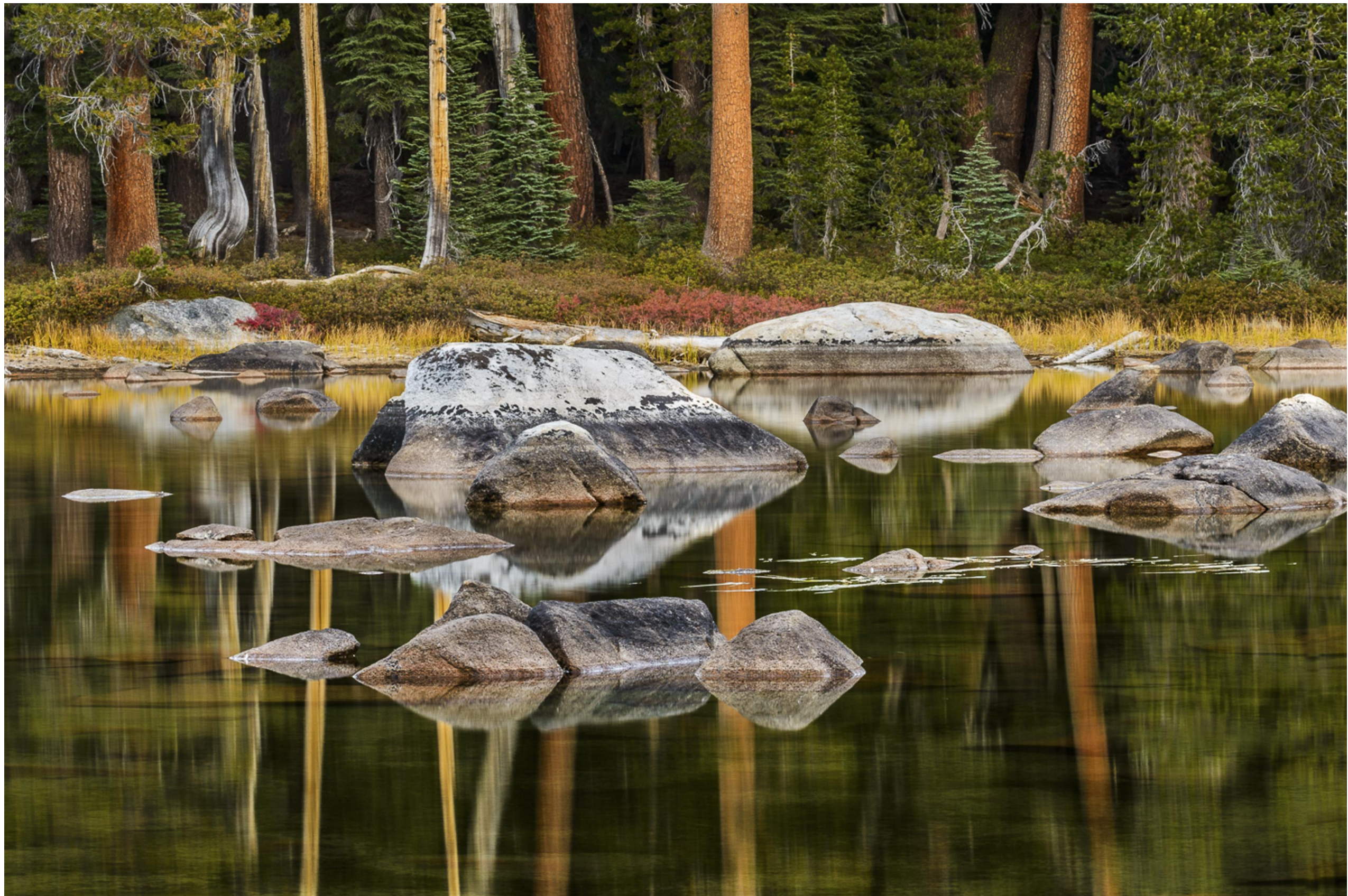
“Weston’s Lake”, Yosemite National Park, California