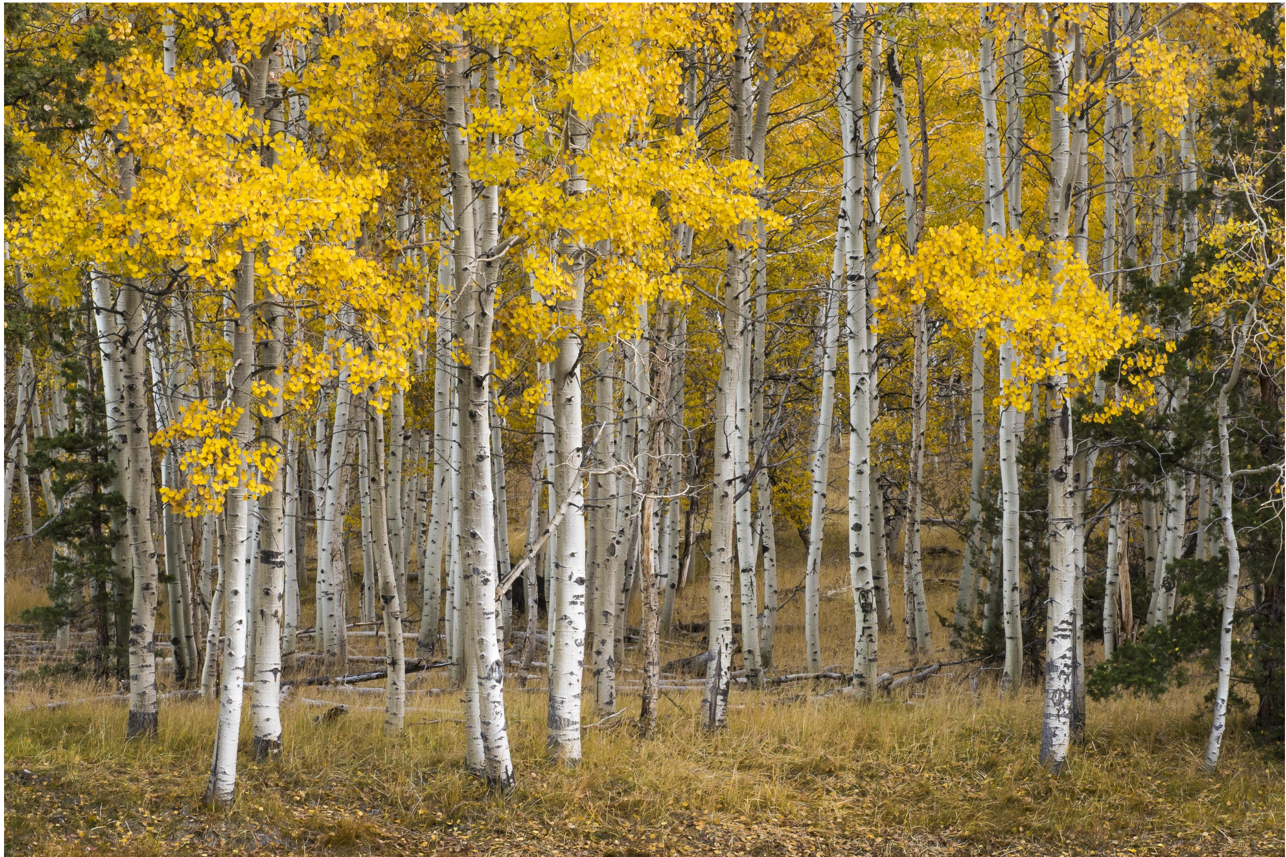
Near Mono Lake, California