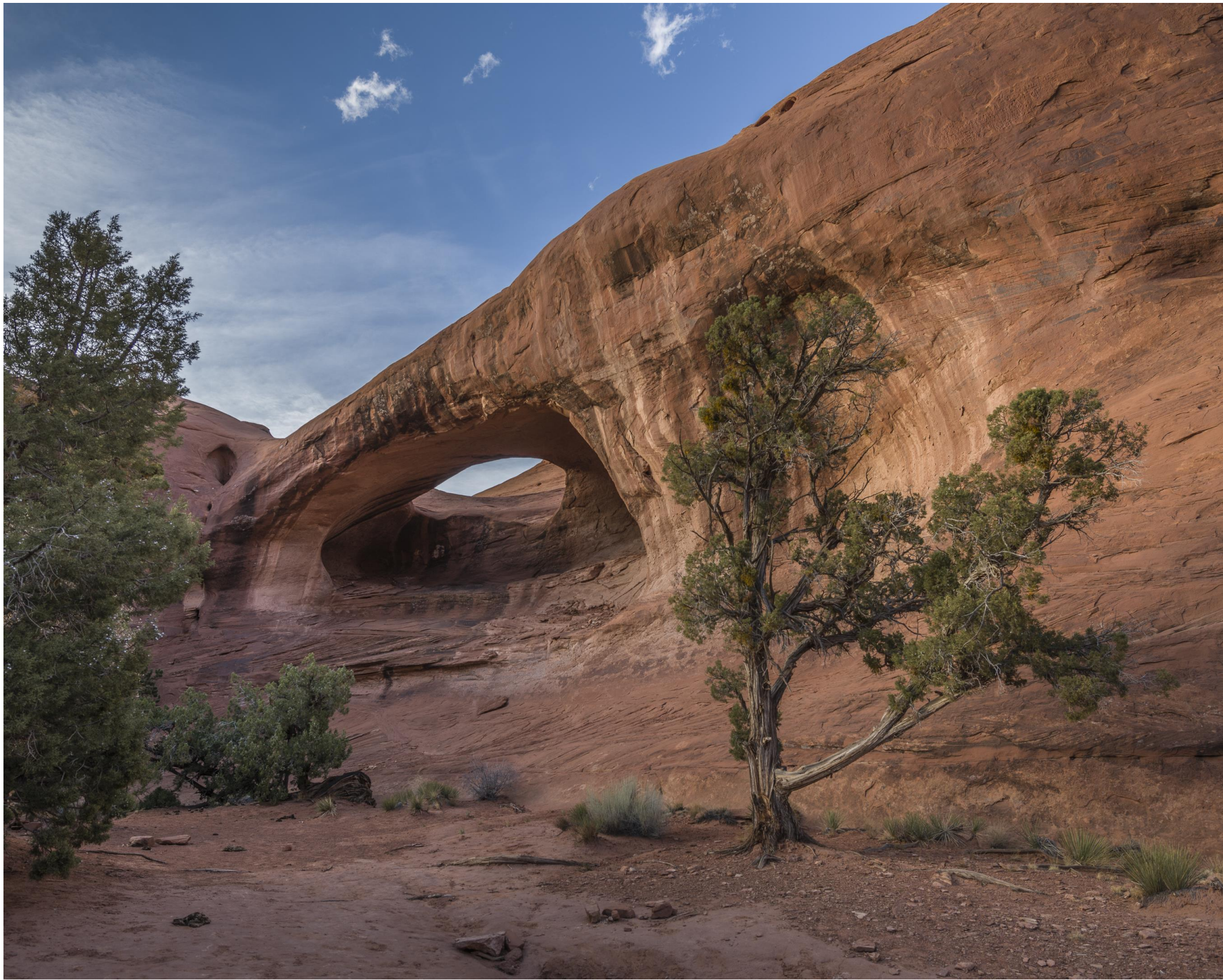
16 mm Mystery Valley, Utah/Arizona