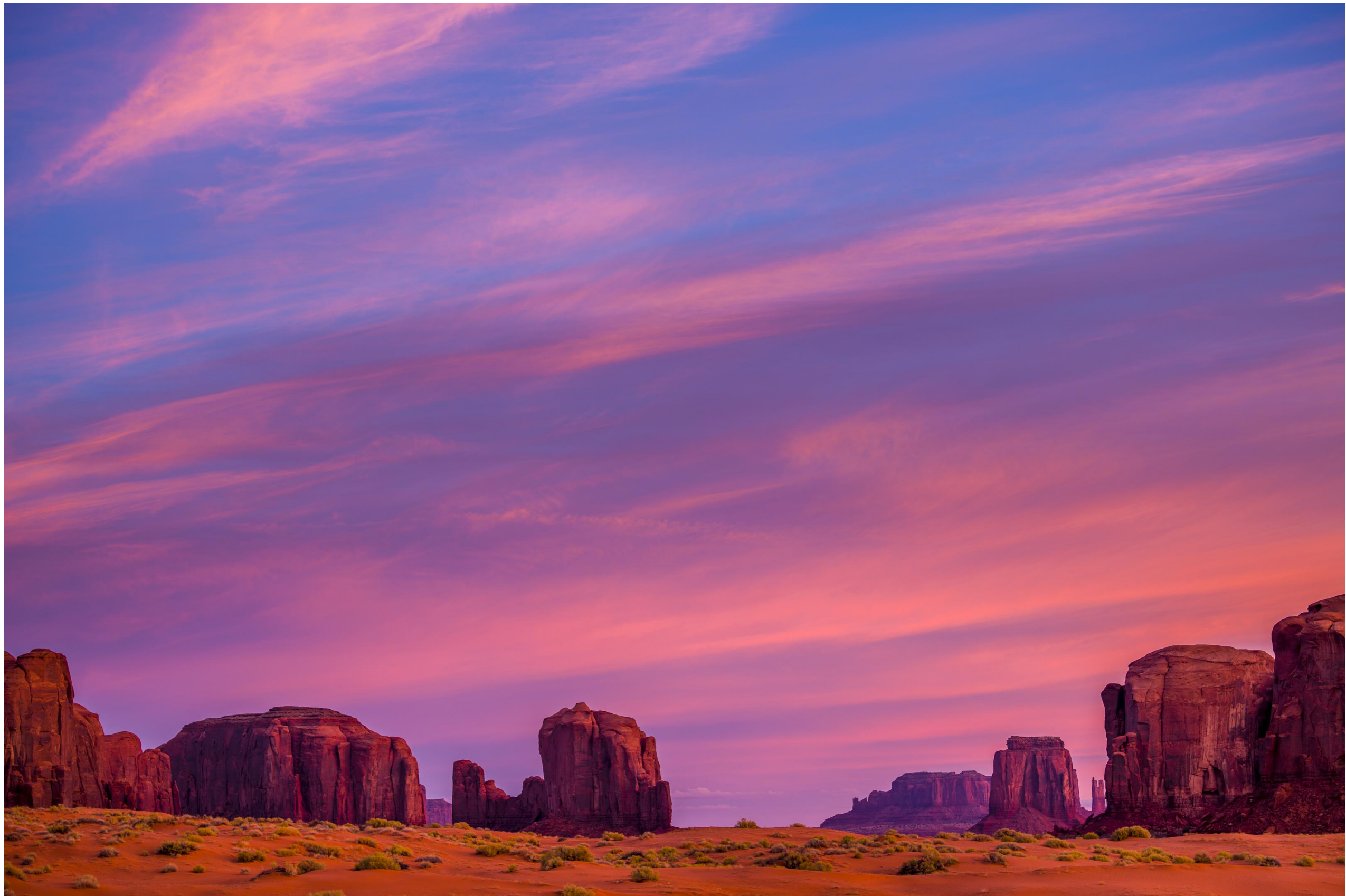
70mm Monument Valley, Utah/Arizona