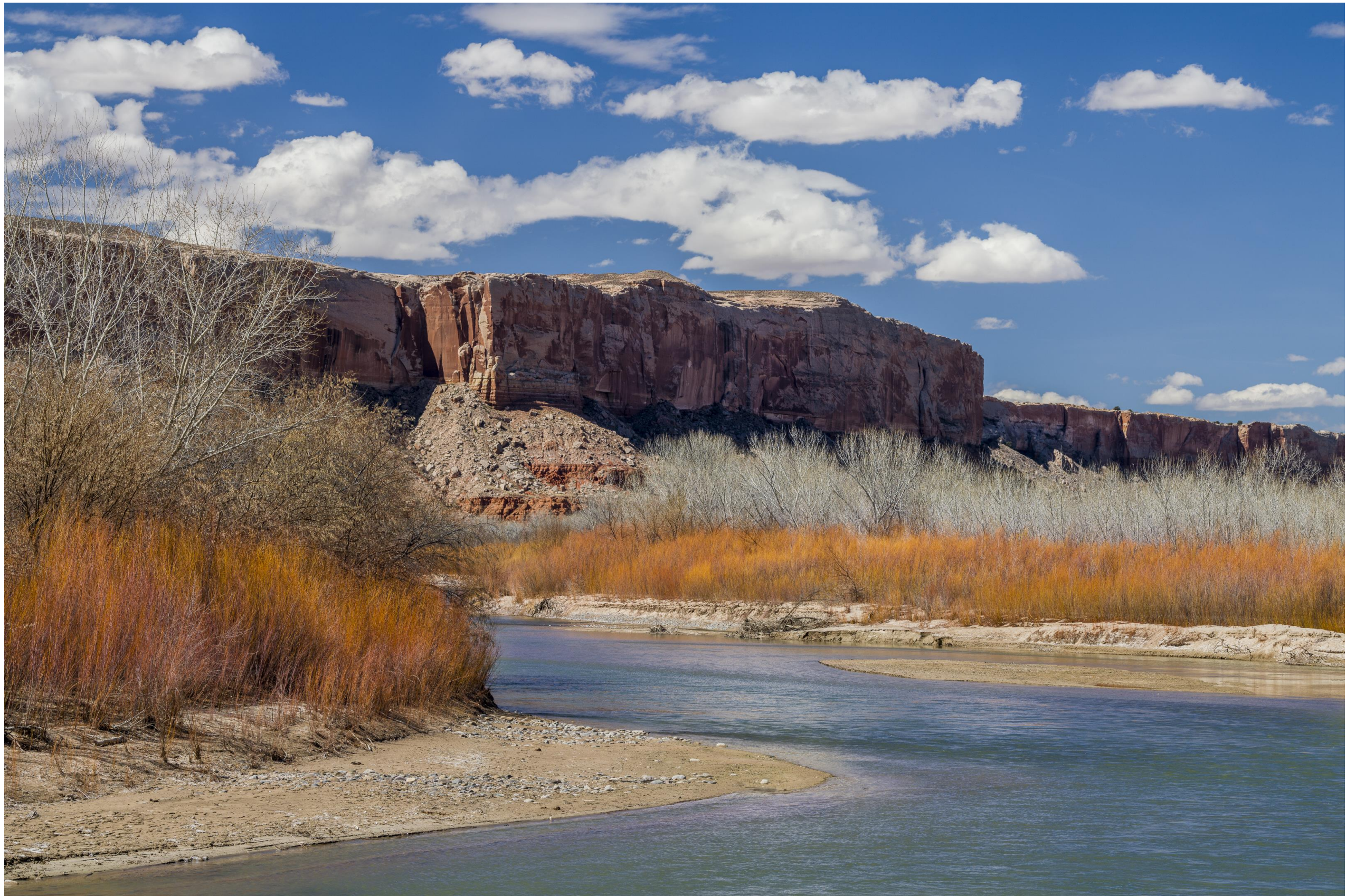
110mm Sand Island near Bluff, Utah