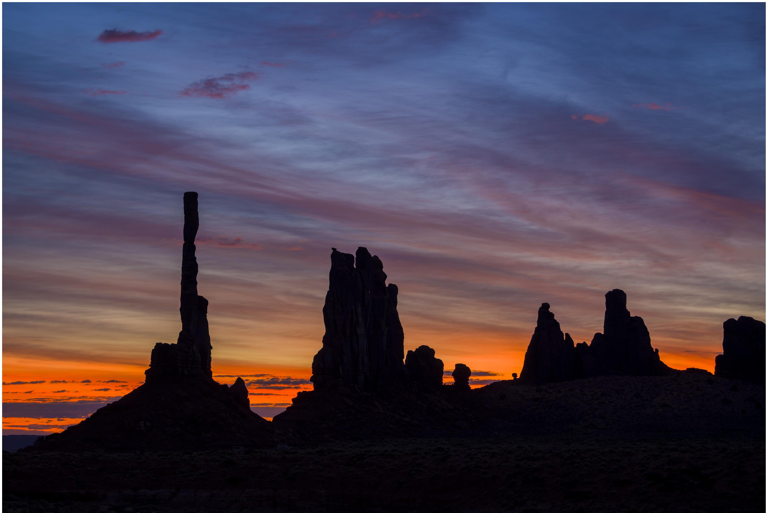
Monument Valley Utah/Arizona