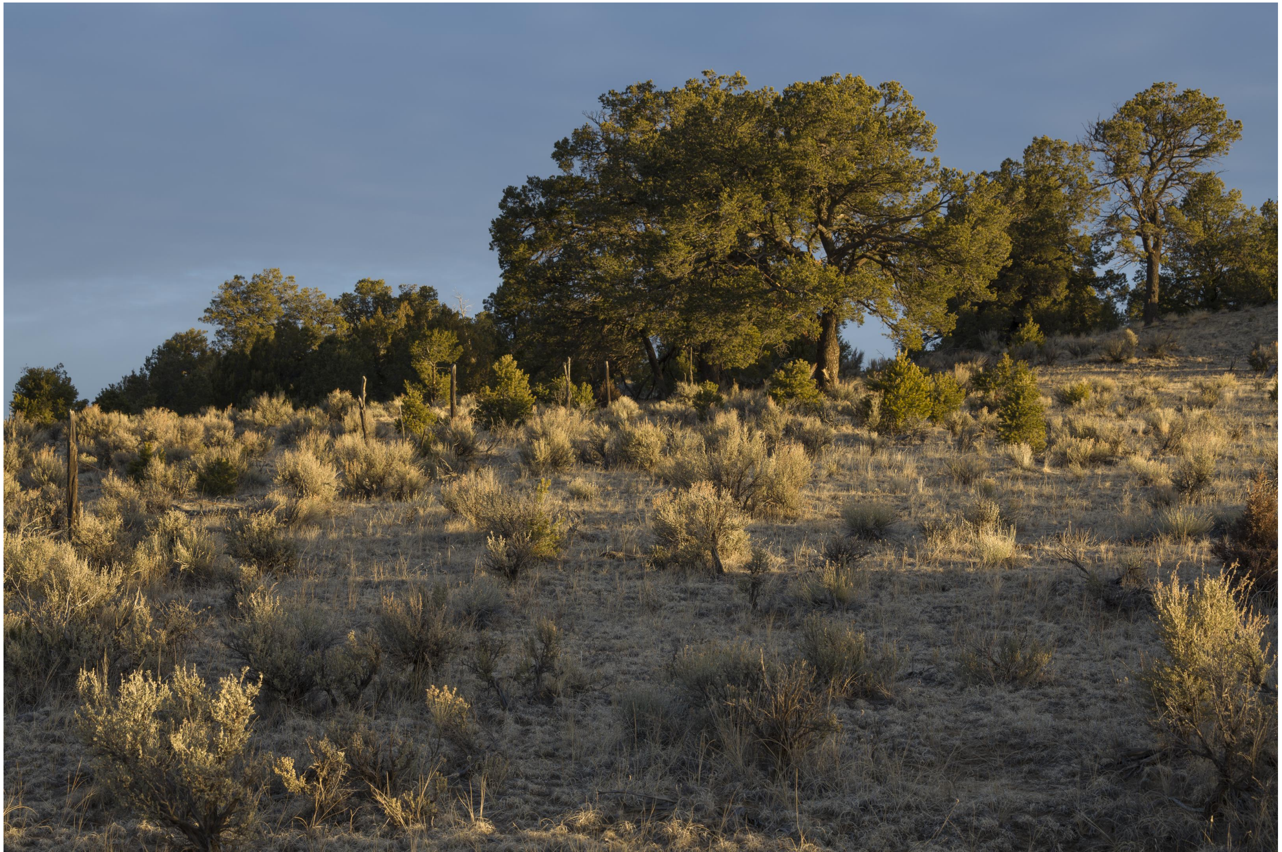
8:41:58 Near Cuba New Mexico