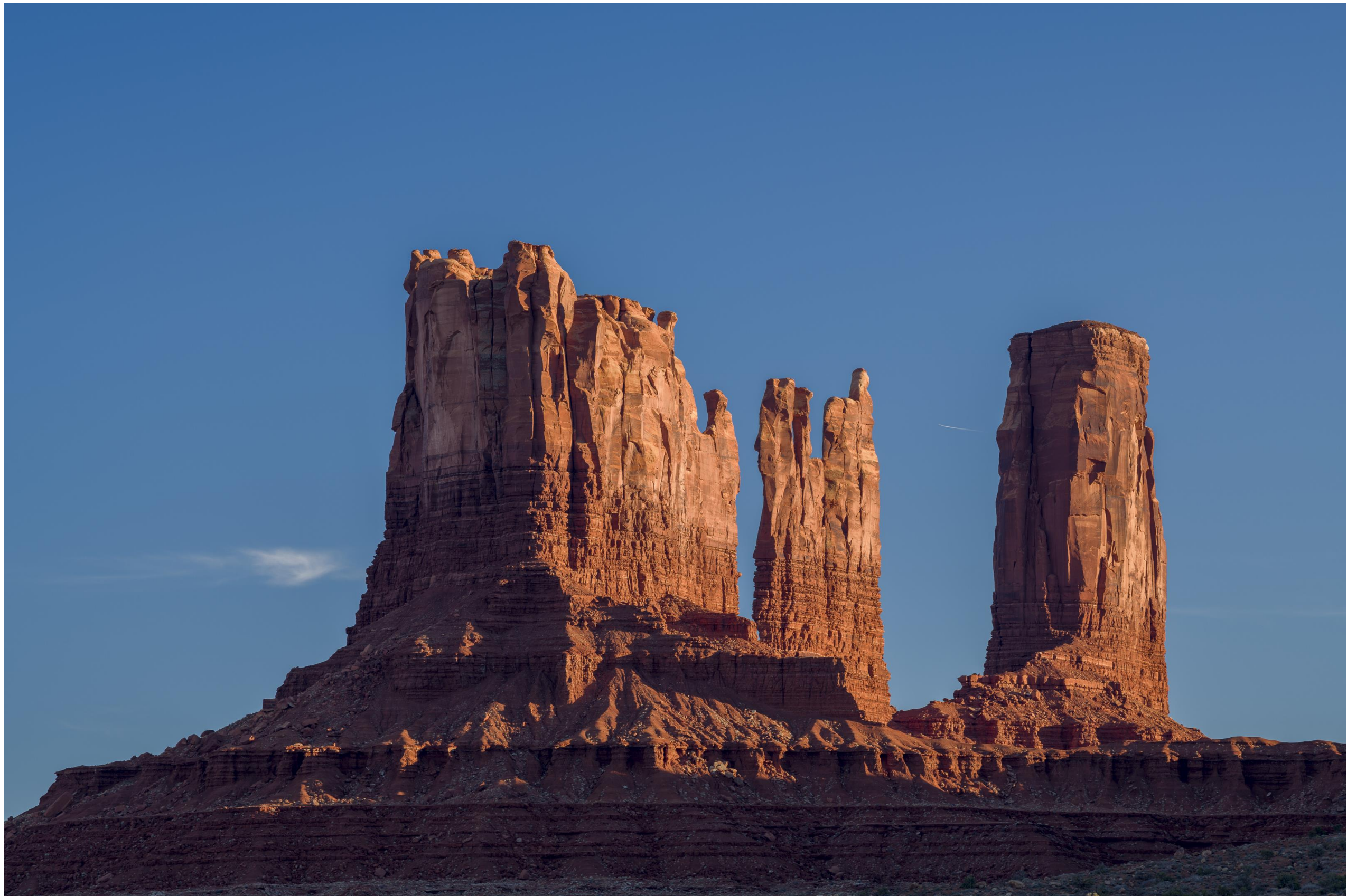
200mm Monument Valley, Utah/Arizona