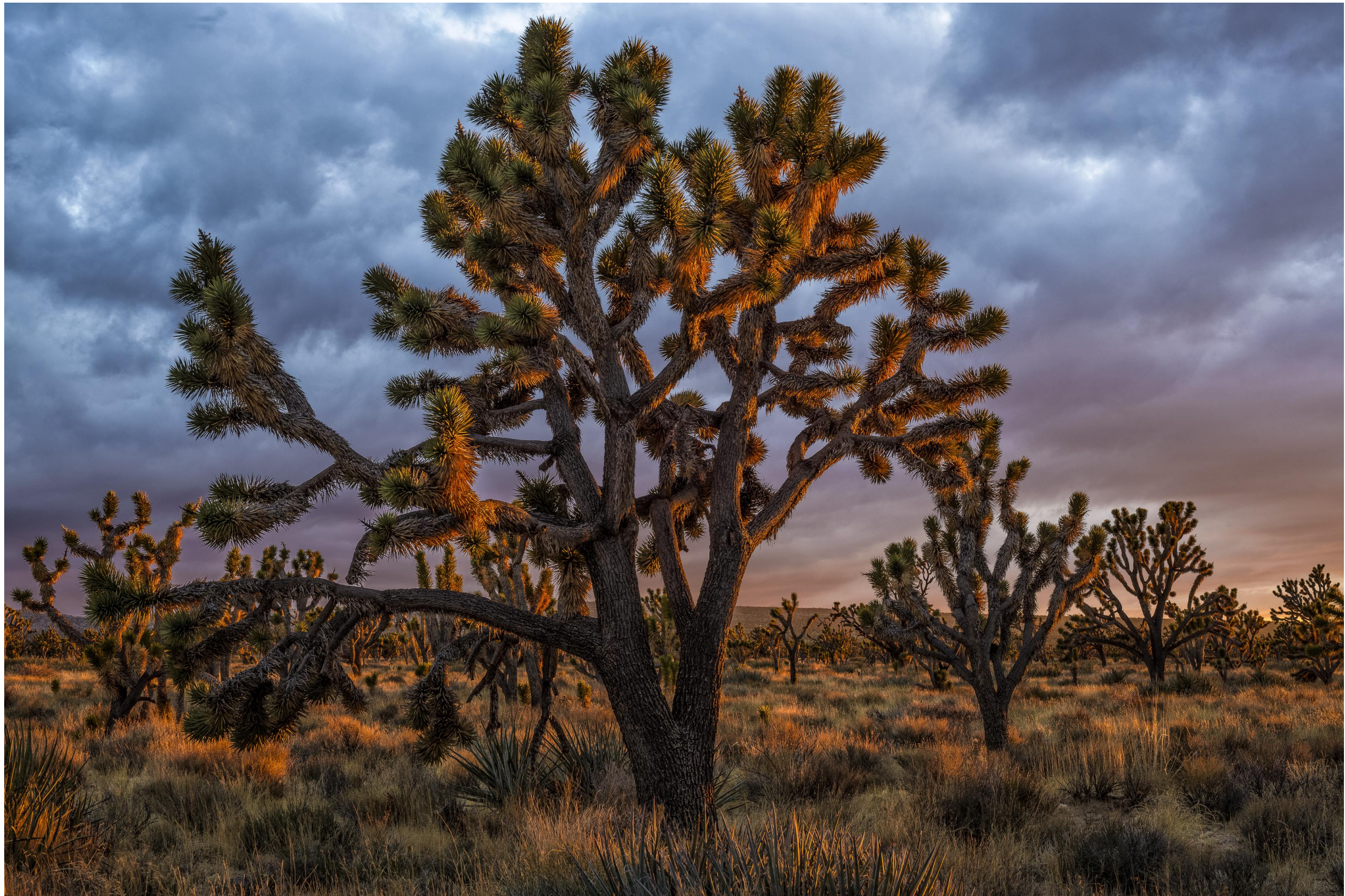
Mojave Natural Preserve, California