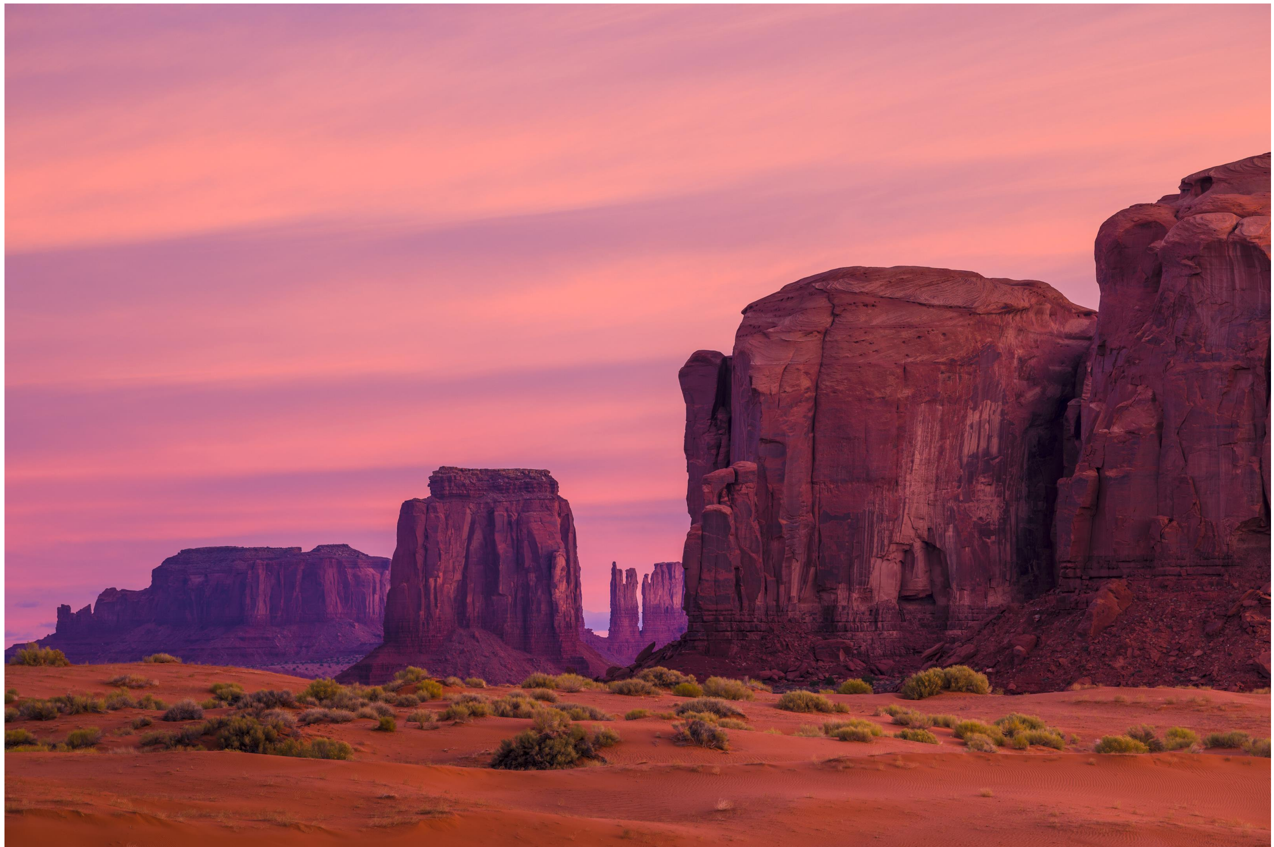
Monument Valley Utah/Arizona