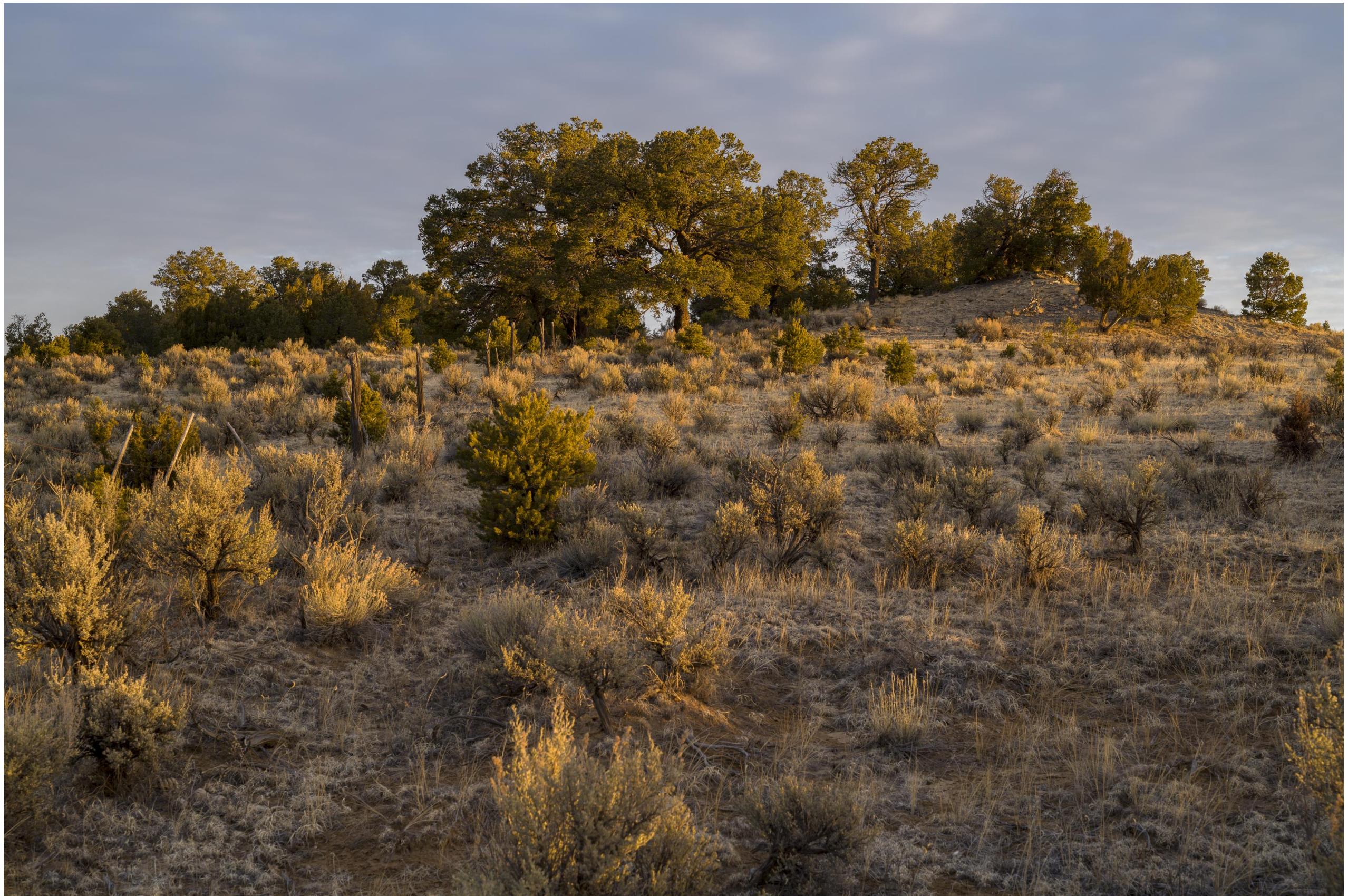
8:38:36 Near Cuba New Mexico