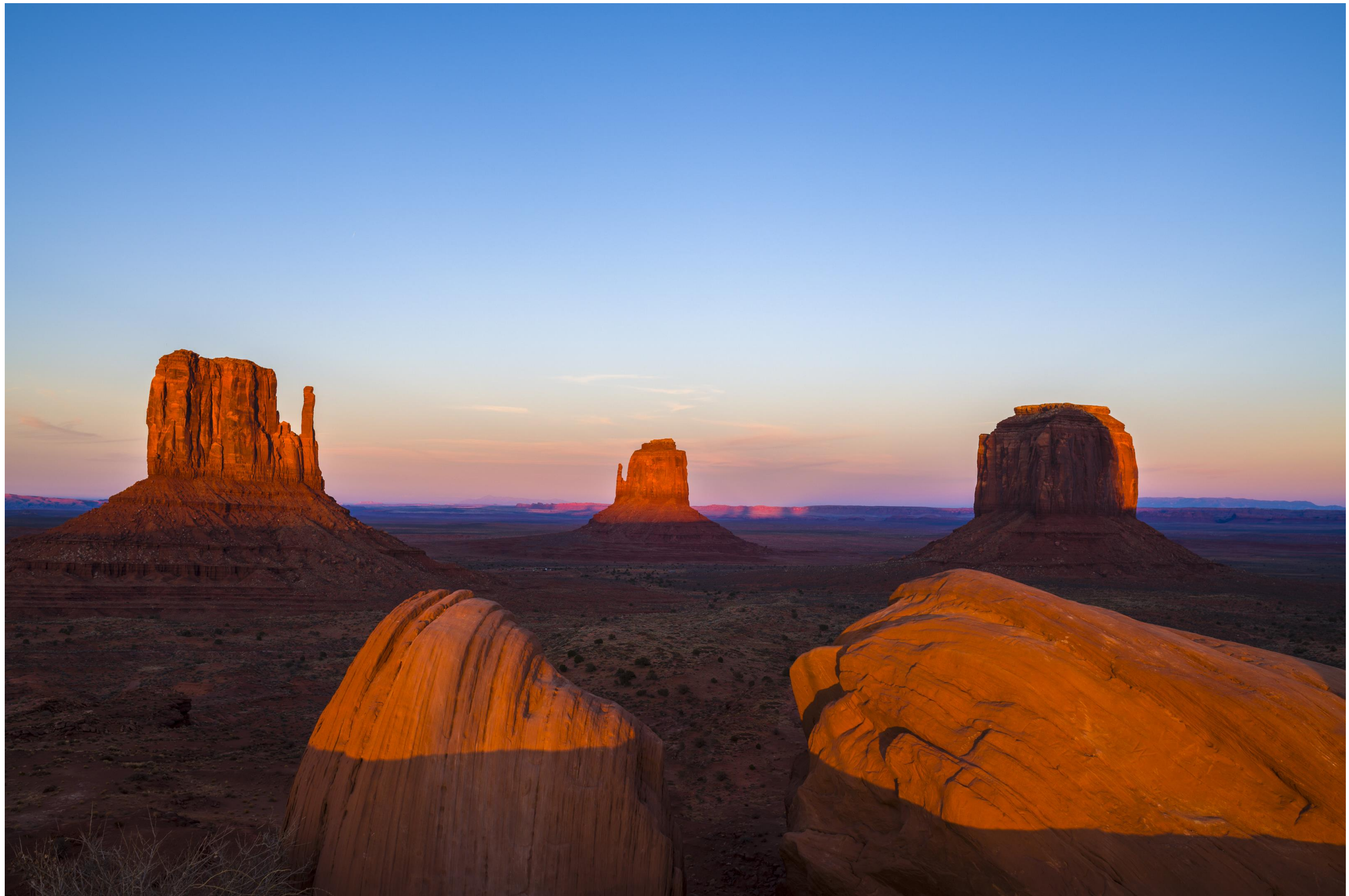
Monument Valley, Utah/Arizona